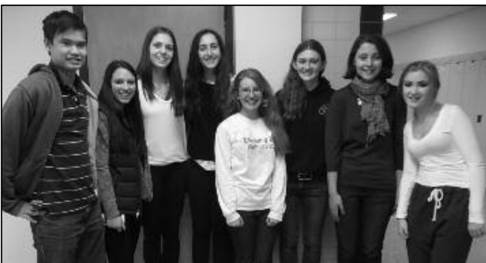
(left, l-r) A small army of student volunteers helped parents find their children's classrooms. Parents had an abbreviated school day, meeting their children's teachers and changing classes. They had to make it to the next class on-time, just as their children must do every day.