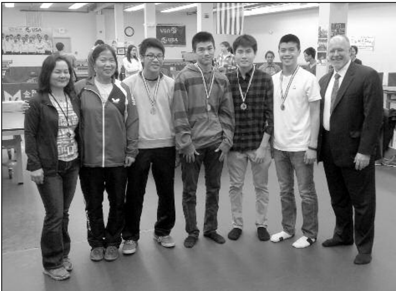
(above) Winners of Watchung Hills High School Tournament at the LYTTC.