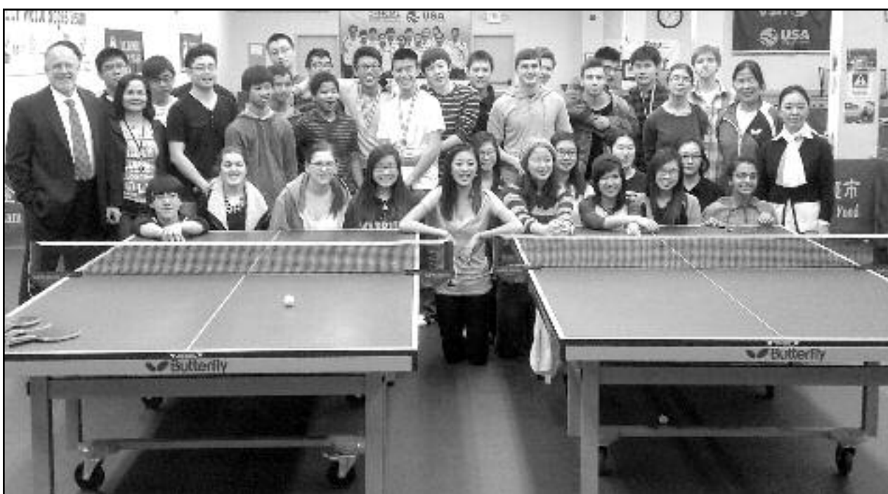
(above) Watchung Hills High School visits LYTTC.