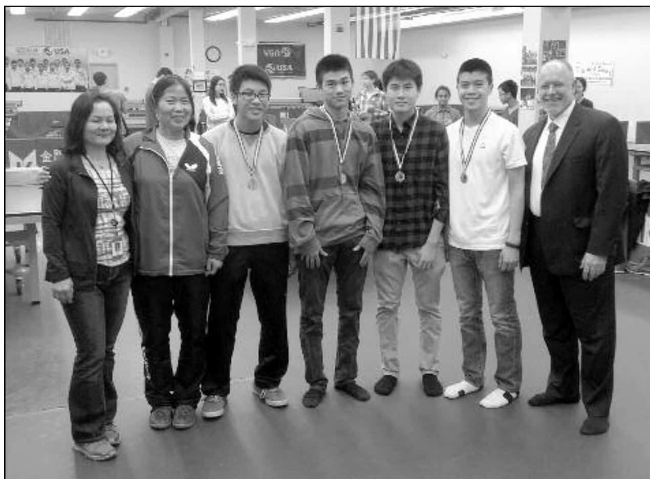
(above) Winners of Watchung Hills High School Tournament at the LYTTC.