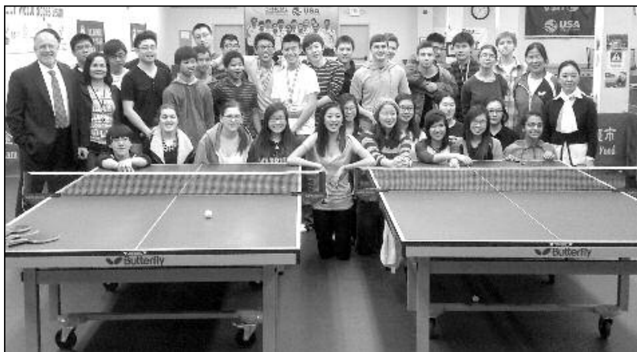
(above) Watchung Hills High School visits LYTTC.