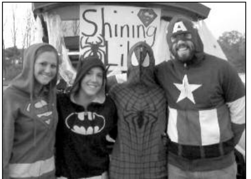
(above) Central School staff members were in the Halloween spirit, enjoying the Trunk or Treat festivities!

PRSR STD-A US POSTAGE PAID Permit #1081 Newark, NJ