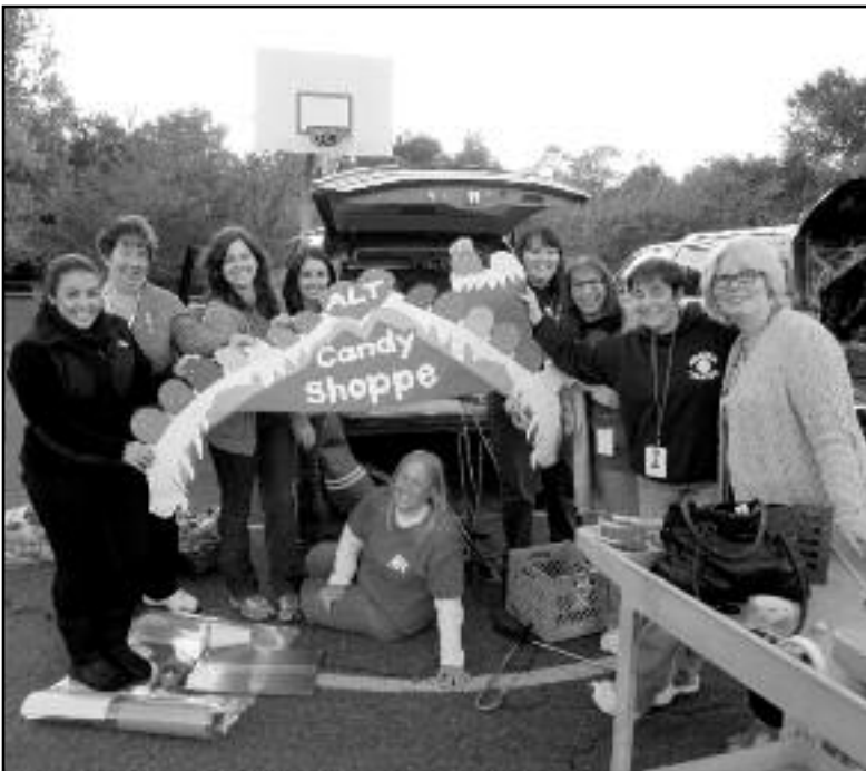
ALT staff decorating a trunk for the "Trunk or Treat" event.