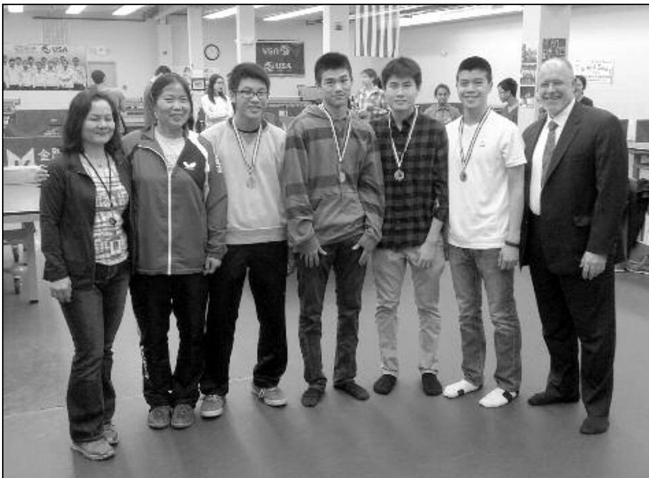
(above) Winners of Watchung Hills High School Tournament at the LYTTC.