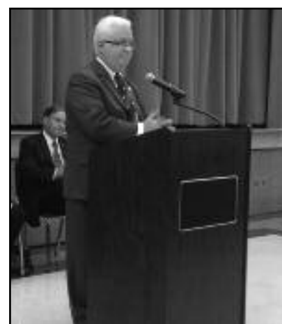
(above) Mayor Stephen K. Pote