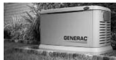
Automatic Standby Generator