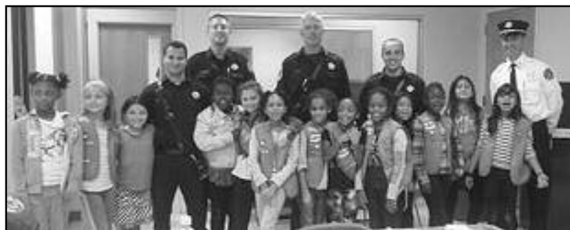
(above) Girl Scout Junior Troop 65942 earn their First Aid badge with the help of the Fire Department and EMS workers.

Every year, our local Girl Scout troops are responsible for putting together Thanksgiving food baskets for some of our North Plainfield families. Each troop is assigned one or two families and everyone pitches in to help our neighbors. In addition, Senior Troops 65133 and 65937 will be hosting a Free Community Thanksgiving Dinner for North Plainfield Residents on Saturday, November 22nd from 2 pm to 5pm at Watchung Avenue Presbyterian Church, 170 Watchung Avenue, North Plainfield. Last year's feast was such a great success with over 150 meals served