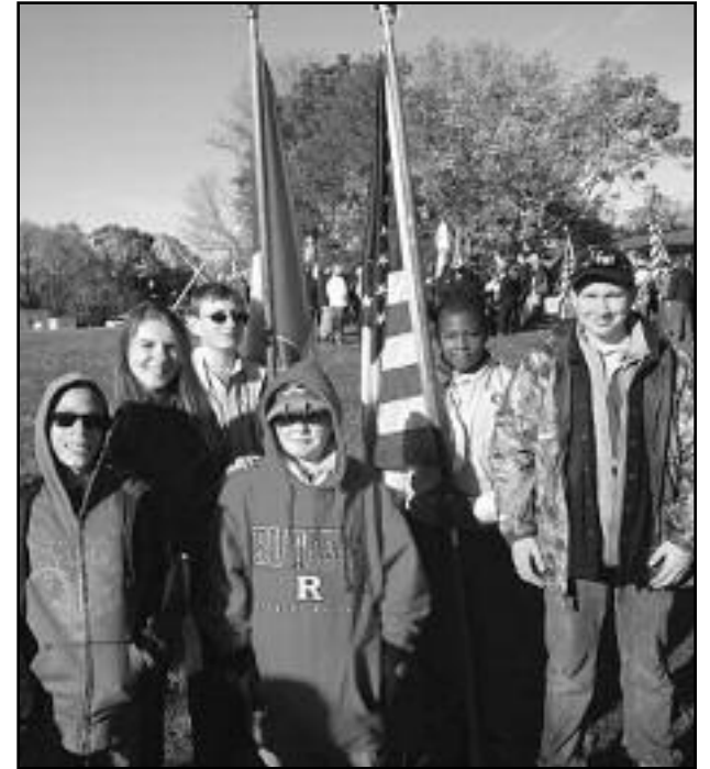
(above) North Plainfield Boy Scout Troop 235 & Venturing Crew 885 attend the annual Boy Scout District Camping at Round Valley, earlier this month. For more information on scouting go to www.scouting.org or www.BeAScout.org .