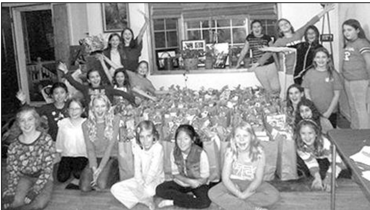
(above) Cranford Junior Girl Scout Troop 40071, with their packing helpers Brownie Troop 40753, completed its "Take Action Journey Project" by collecting food to fill 65 bags of "Thanksgiving Trimmings" to donate to Cranford Family Care. The Troop held a food drive at the Garwood Pathmark and also collected food from other troops, families, businesses, and friends.