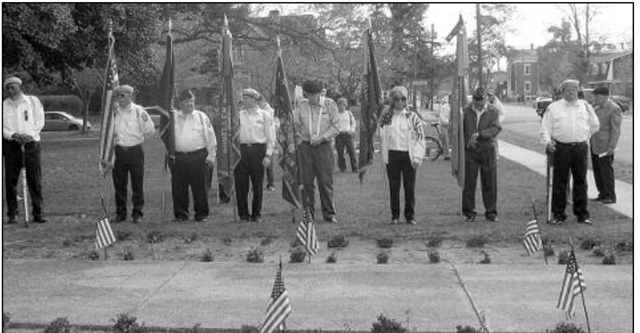
(above) Veterans Day ceremony held at Washington Memorial Park