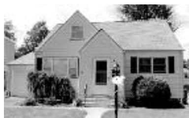
1030 Field Road - SOLD IN 38 Days!

Proudly Celebrating our 30th year as your Hometown Real Estate Office.