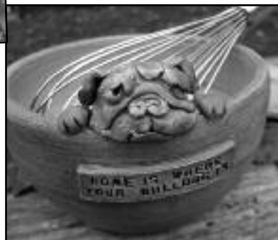
(right) Dog themed pottery