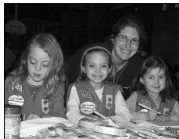
(above, l-r) Daisy troop 40744 from Bloomfield Avenue School participated in the Martin Luther King, Jr. Day of Service.