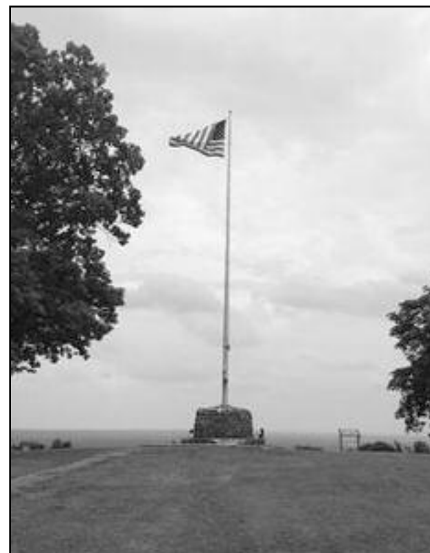
(above) Washington Rock in Green Brook

Wagenblast's goal is to collect 100 sounds a year and complete the project in six years. If you have a suggestion for a sound for New Jersey 565 you can reach Bernie at bernie@bwcommunications.net .