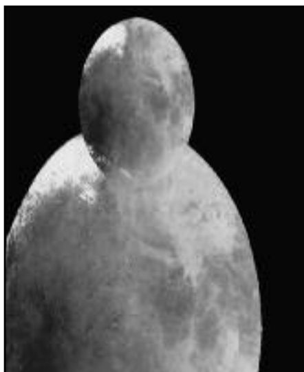
(left) Susan Ahlstrom's (Stirling) "Black and Blue Under Fire"

The Watchung Arts Center, located on the circle at 18 Stirling Road in Watchung, presents a new art exhibition each month along with performances of music, and comedy. Call 908-753-0190 for more information about these programs or www.watchungarts.org .