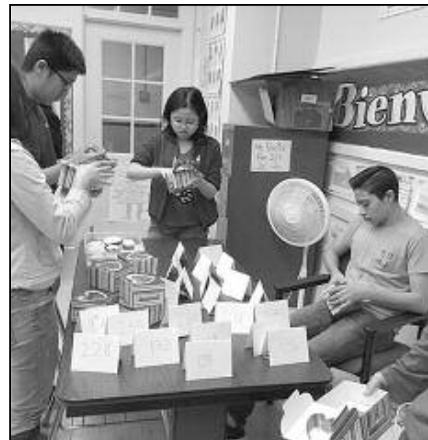
(above) North Plainfield High School Interact Club members prepare the special Valentine's Day cupcakes for delivery. The club raised $350 from this project to support their community service activities.

More information about the club can be found at www.RotaryPNP.org .