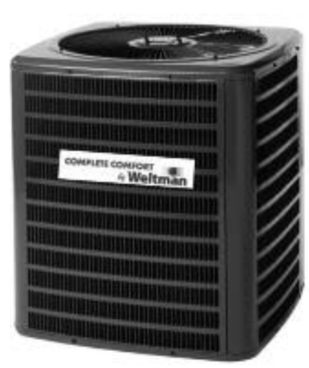
On qualifying systems only. Offer cannot be combined with other discounts.