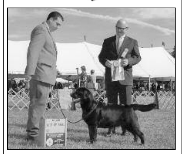
We are the proud breeders and owners of the Number 1 Labrador Retriever in the USA for 2014

Hours: M-F 8 - noon; 5 - 7 pm Sat: 8 - 3 Sun: 10 - 12