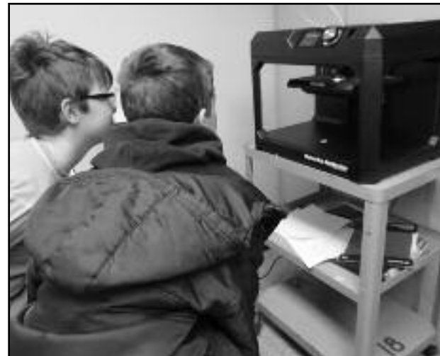
(above) The Library's new 3D printer, thanks to a generous donation from the Ralph W. Errington Fund.

The Kenilworth Chamber of Commerce is delighted to announce our continued support of graduating Kenilworth high school seniors!