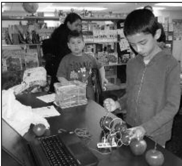
(above) Experimenting with conductivity.