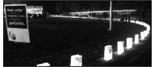
(above) Hundreds of candles in honor of those who've endured cancer line the track at a New Jersey Relay For Life. The American Cancer Society is seeking volunteers for their upcoming event in Kenilworth which will take place on Saturday, June 13 to 14, 2015.

New teams and Team Captains as well as individual participants are always welcome to join and contribute fresh ideas. Groups of all types and sizes such as businesses, community groups, civic associations, religious organizations, schools, informal groups of friends and family as well as individuals are