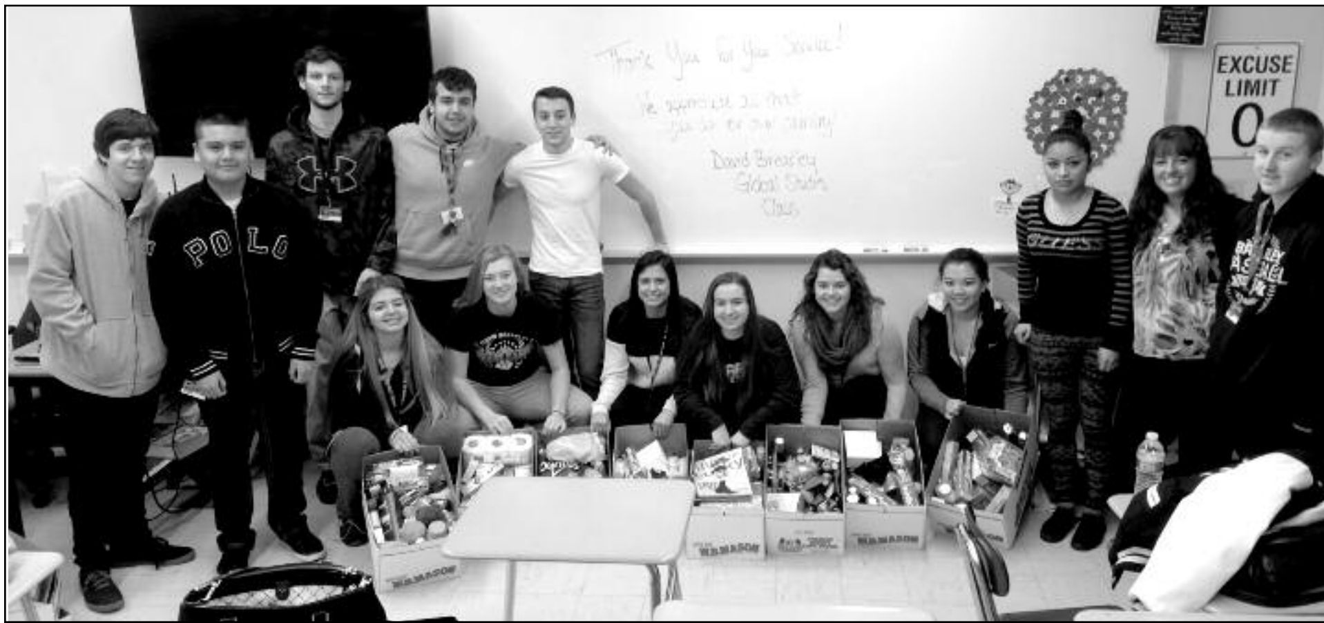
(above) David Brearley Middle/High school students collected all kinds of toiletries to send to the soldiers overseas. The VFW in Kenilworth will be shipping all the items to the servicemen and women.