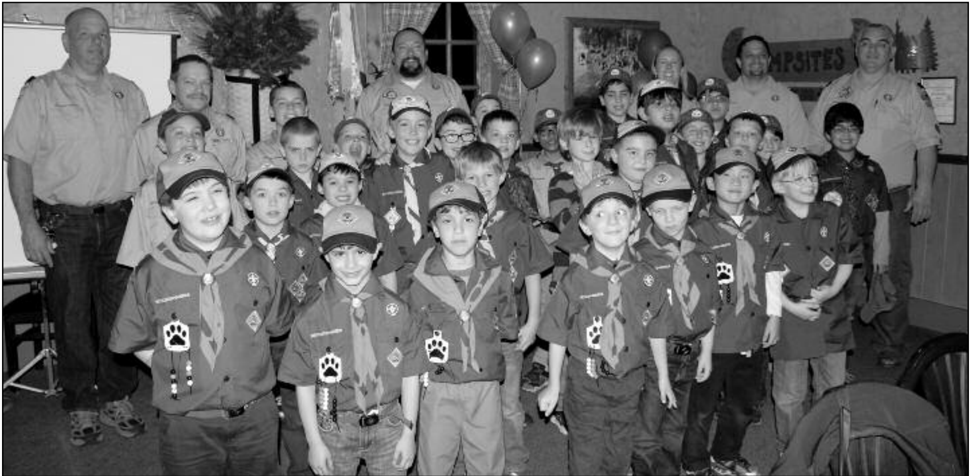
(above) Cub Scout Pack 129 at recent Blue & Gold Dinner

Cub Scouts Pack 129, based in Green Brook, is open to all boys aged 7-10 (grades 1-5). For information about Pack 129 you may visit pack129greenbrook@scoutlander.com .