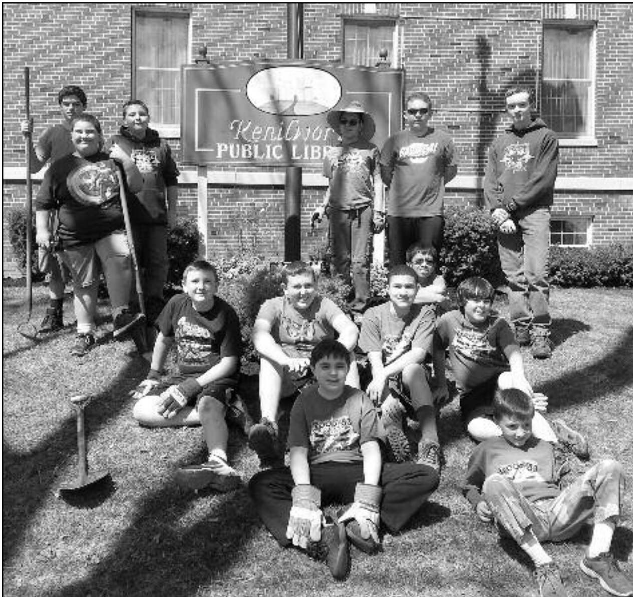
For Earth Day, Kenilworth Boy Scout Troop 83 cleaned up the Kenilworth Public Library. They cleaned out leaves and weeds and put down new mulch. The mulch was generously donated by the Hartman family of Jersey Landscape & Garden Supply located in Kenilworth.