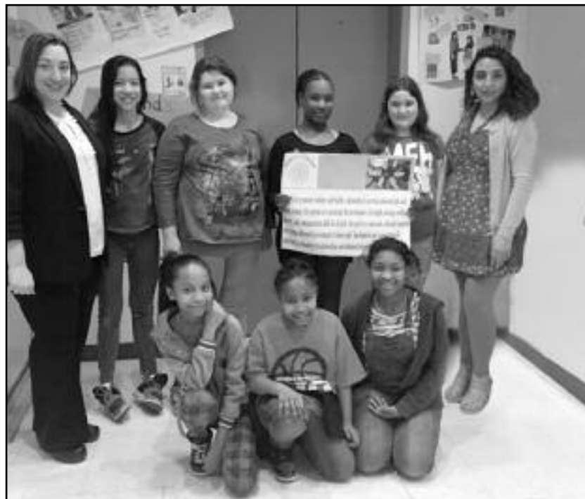
(above) "Girls Circle" participants and leaders at Somerset

It's a second home where the girls are not only telling each other stories, but are opening up pieces of their lives to each other as well as helping one another grow from their experiences. After a year of these