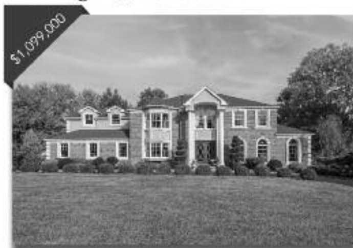
10 Ellsworth 5 Bedrooms, 3.1 Baths Stunning Center Hall Colonial with Fabulous Decor and Many Upgrades. A Must See! 10Ellsworth.com