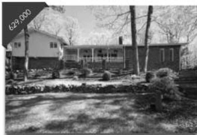
14 Jennifer Lane 4 Bedrooms, 3.5 Baths Updated 4 Bdrm Ranch with Scenic Views. Eat In Kitchen w Gourmet Kitchen Appliances. 14Jennifer.com