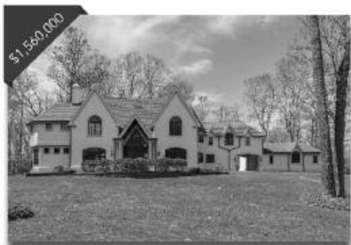
4 Blue Jay Court 4 Bedrooms, 4.2 Baths Custom Designed Colonial with many Upgrades. Perfect for all Entertaining! 4Bluejay.com