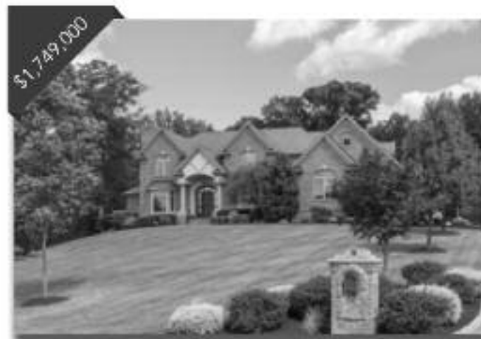
17 Raspberry Trail 5 Bedrooms, 4.1 Baths Full Walkout Basement. Beautiful Custom Home in Desirable Brookside Manor. 17Raspberry.com