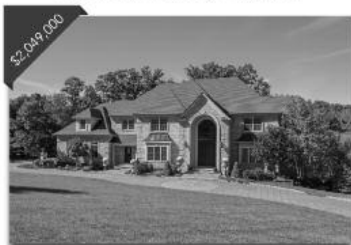
24 Raspberry Trail 5 Bedrooms, 5.1 Baths Massive Gourmet Kitchen with Designer Appliances in sought after Brookside Manor. 24Raspberry.com