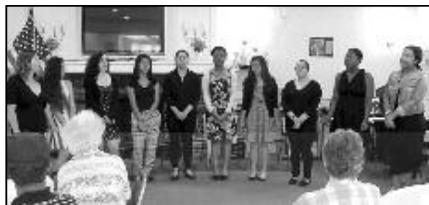
Members of A Cappella Group from North Plainfield High School