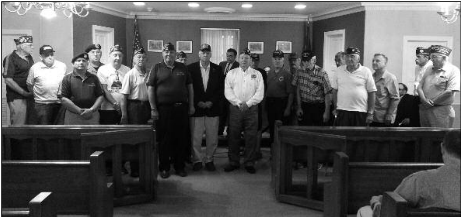
(above) During the Kenilworth Council meeting held on July 8, 2015 Mayor Fred Pugliese read a proclamation recognizing the 70th anniversary of the end of World War II. Over a dozen veterans were in attendance. Council meetings can be viewed on the Borough's website www.kenilworthborough.com .