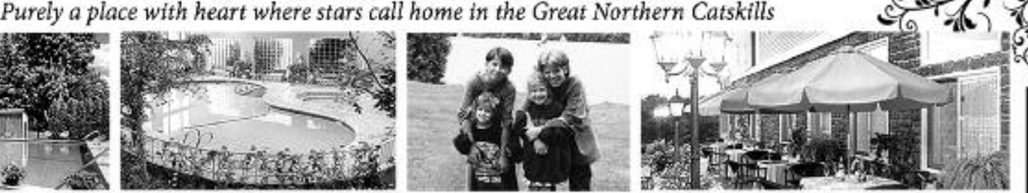
Intimate ~ Italian Resort ~ Boutique