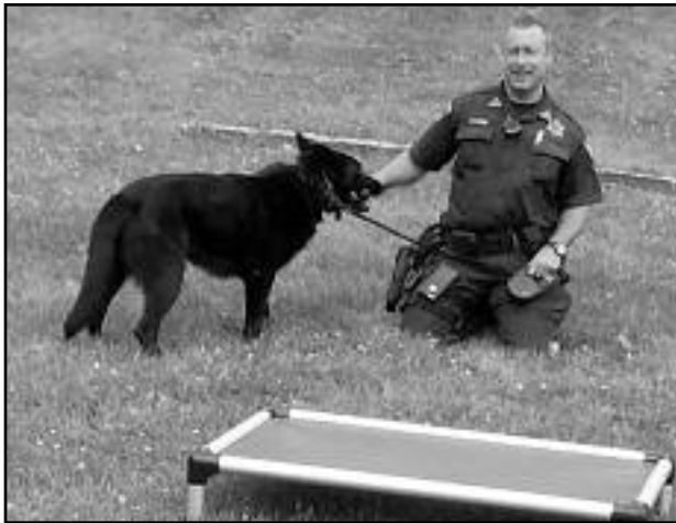
(above) K-9 Demonstration