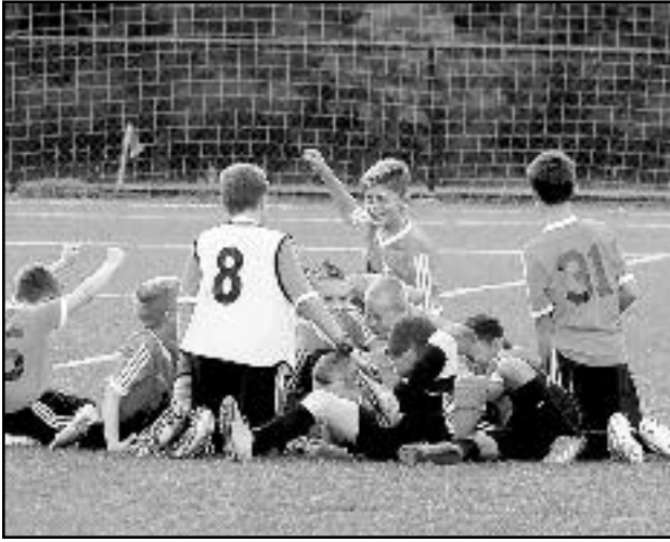
(above) Scorpions celebrating their big win!

The final game was a nail-biter that took the team into a penalty shoot-out which they ultimately prevailed in. The boys are off to a great start this season and currently ranked 52rd in the state.