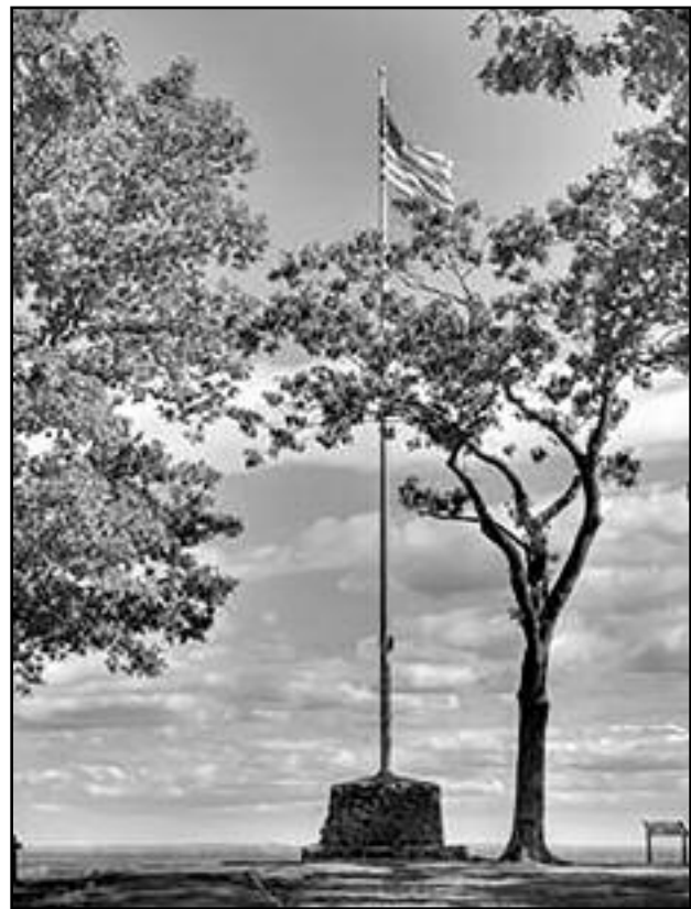
(above) Washington Rock State Park, scenic lookout and park on Washington Avenue in Green Brook.