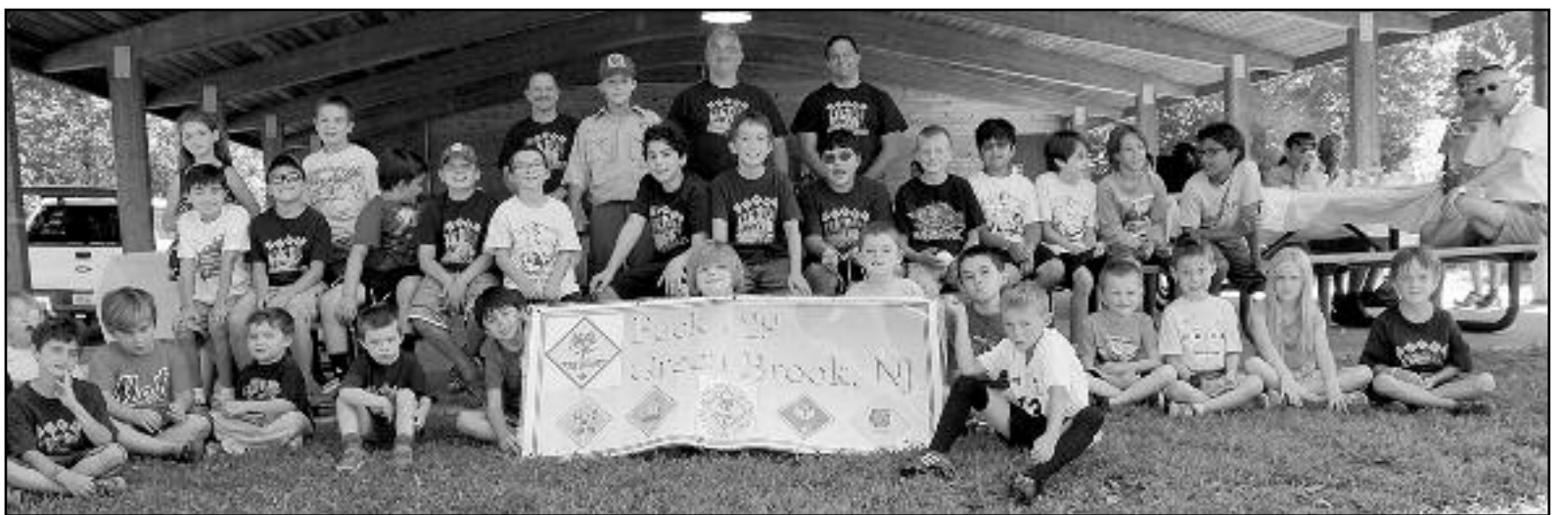
(above) Green Brook Cub Scout Pack 129 at this year's "Welcome Back" picnic/carnival.