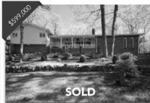
22 Old Smalleytown Road 3 Bedrooms, 2 Baths Must see Home Larger than it Appears! Located on a Large, Level Lot. 22oldsmalleytown.com