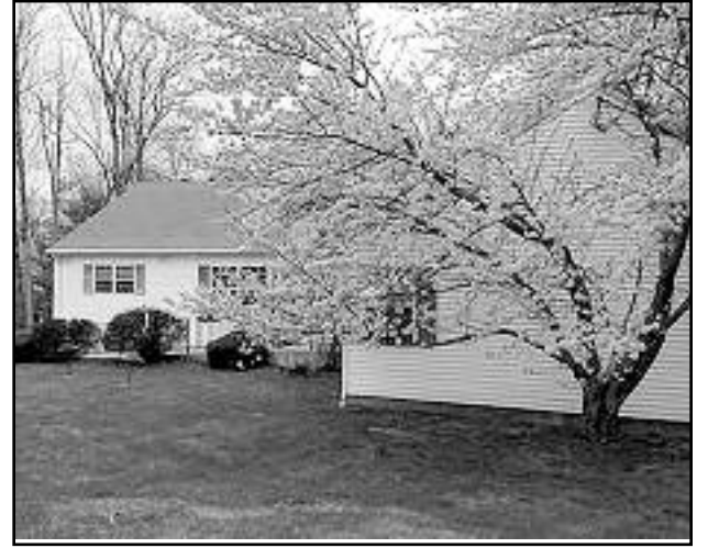
(above) A single-level ranch home from CHC in Warren Township.