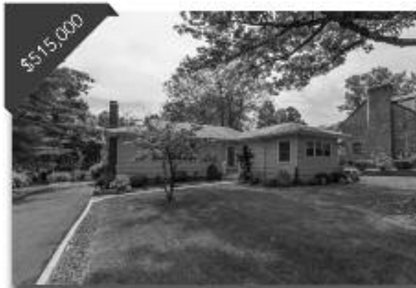
21 North Road 2 Bedrooms, 1 Baths Fabulous Opportunity! Tear down and build your dream home or fix up and enjoy! 21North.com