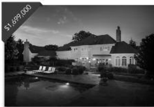
4 Blue Jay Court 4 Bedrooms, 4.2 Baths Custom Designed Colonial with many Upgrades. Perfect for all Entertaining! 4Bluejay.com