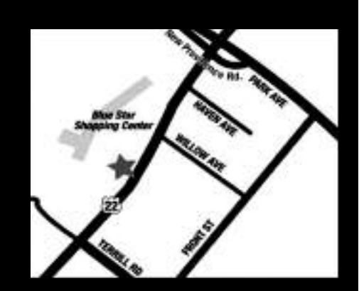
Large Parking Lot to Accommodate our Customers

www.hibachigrillandbuffetnj.com BLUE STAR SHOPPING CENTER