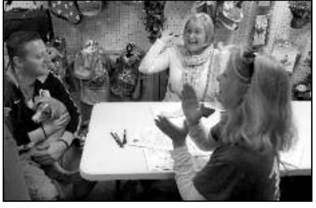
(above) Members of the Perrone family react with surprise upon being informed they are adoption number 4,000.

The 100-percent foster-based Home for Good