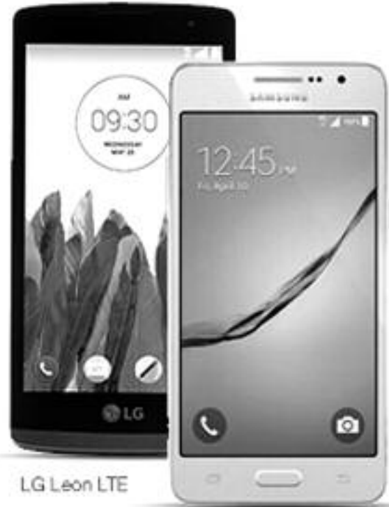
LG Leon LTE

$30 Unlimited with fast 4G LTE data. First 1 GB of data at up to 4G LTE speeds