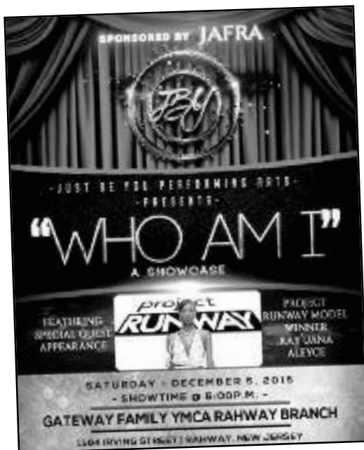
(above) Who Am I showcase cover.