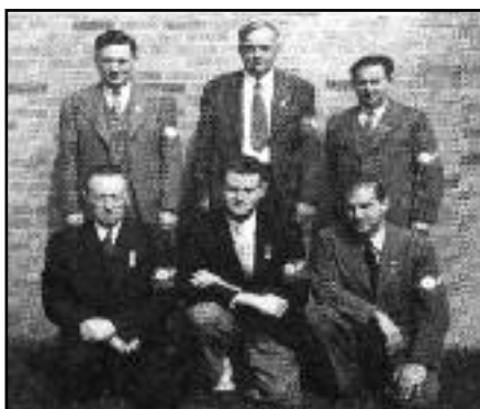
(above) Rahway air-raid wardens who received the Army Merit Medal for airplane observation during World War II. As part of the Civil Defense Service, these men logged in 500-2500 hours keeping their eyes skyward watching for enemy planes.