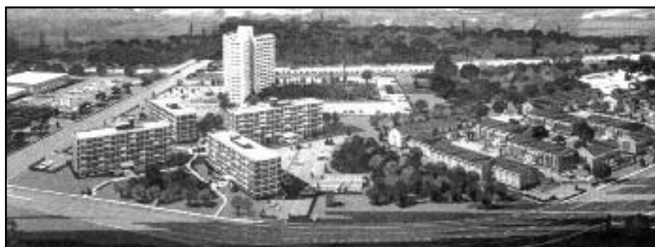
(above) One plan for the 26 acre redevelopment tract that never materialized was Village Green, a mix of high rise apartments, townhouses, and single family homes.

With the possibility of war becoming more and more of a reality, Rahway began making preparations. Aluminum and metal were being collected, residents were asked to conserve paper, and a gas curfew was in place.