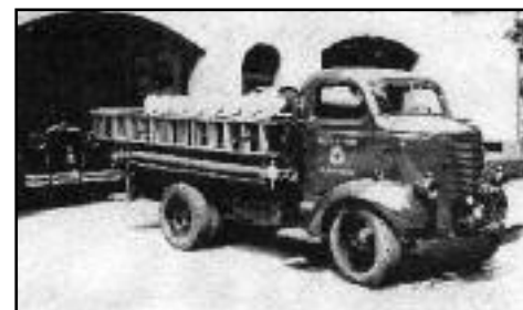
(above) Auxiliary truck used for Civil Defense during World War II.