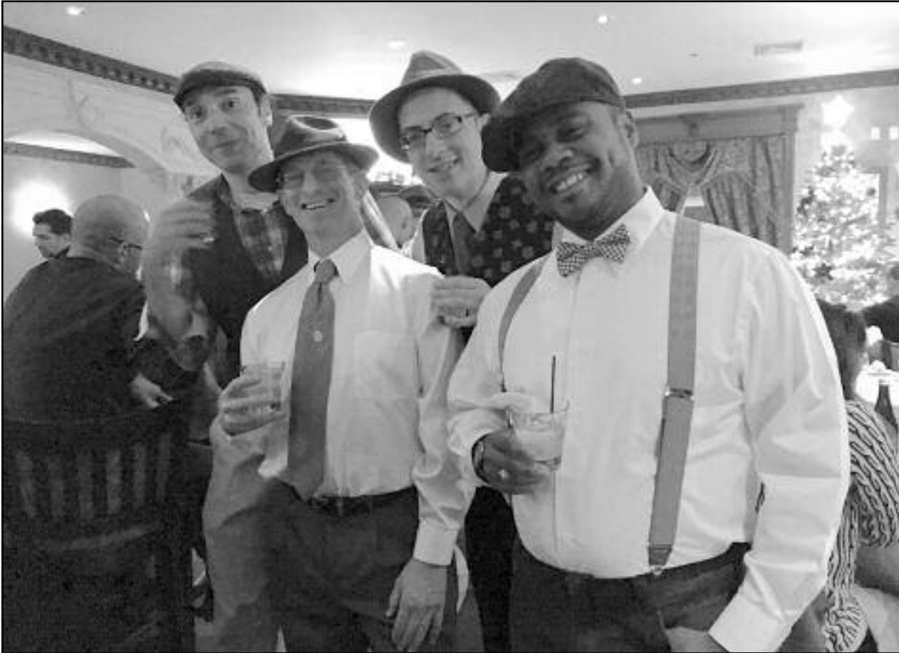
(above) During the December Cinco themed event, participants dressed up to celebrate the anniversary of the end of Prohibition.

For information on where the group will be meeting the 5th of every month, you can like their Facebook page, Cinco de Drinko Rahway.