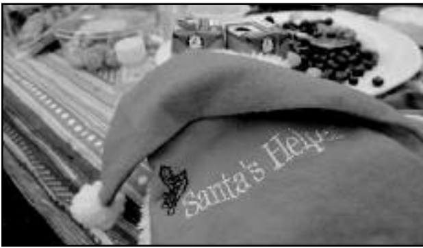
(above) The warmer-than-normal temperatures made for a great time to serve snacks outside.