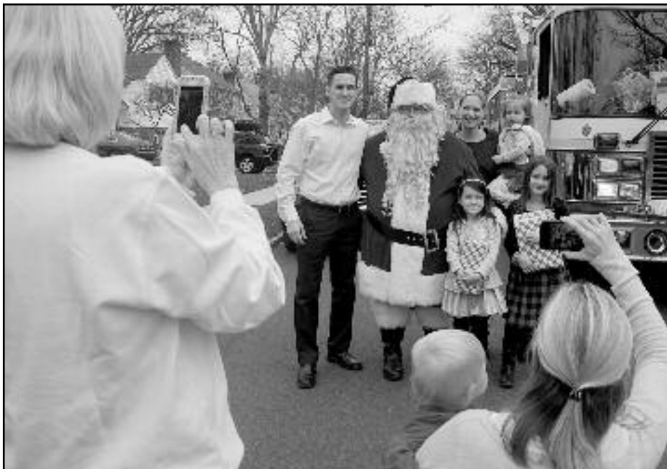
(above) Santa is the center of attention while delivering gifts on the Fanwood Fire Department's "Santa Run".