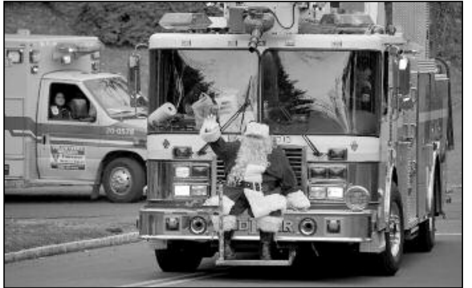
(above) Riding aboard the Fanwood Fire Department's Ladder One, and accompanied by the Rescue Squad, Santa turns down a street to deliver presents.