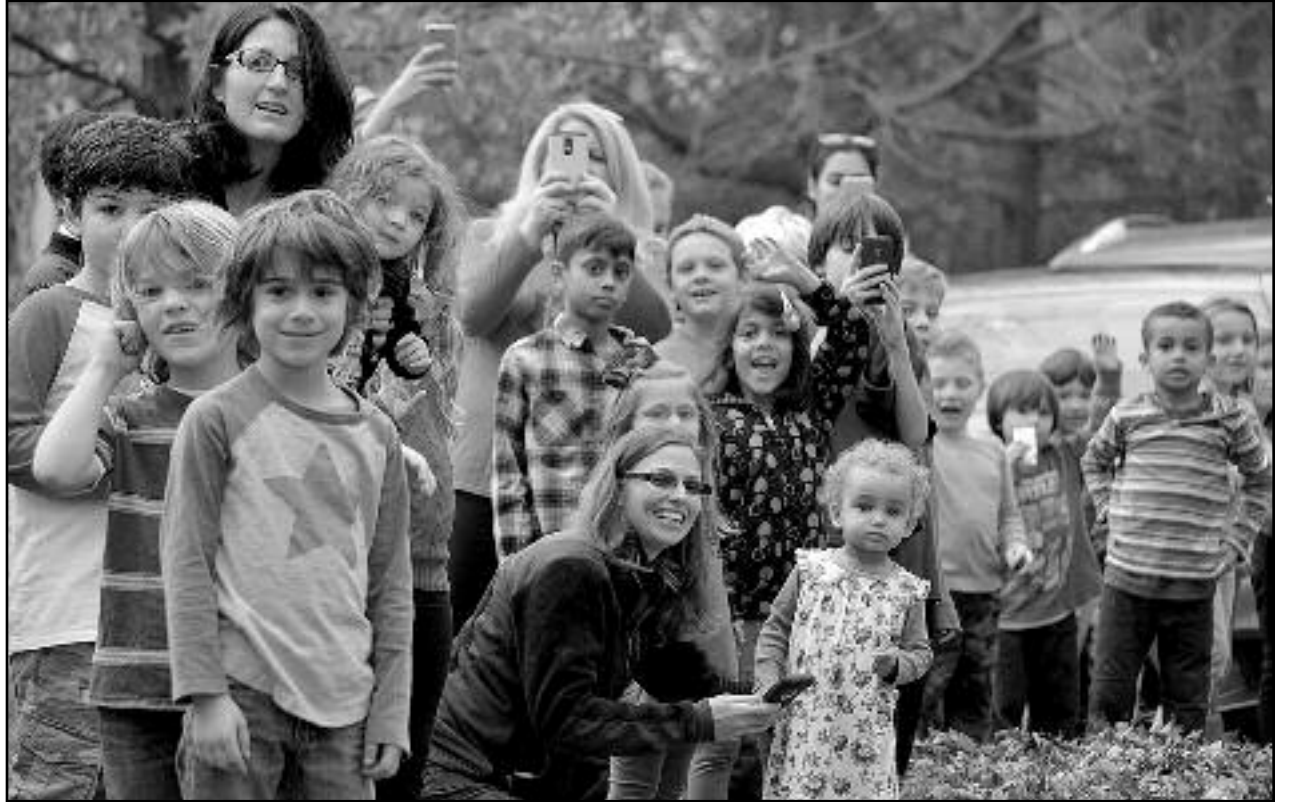
(above) Kids and adults alike watch as Santa pulls on to their street during the Fanwood Fire Department's "Santa run".