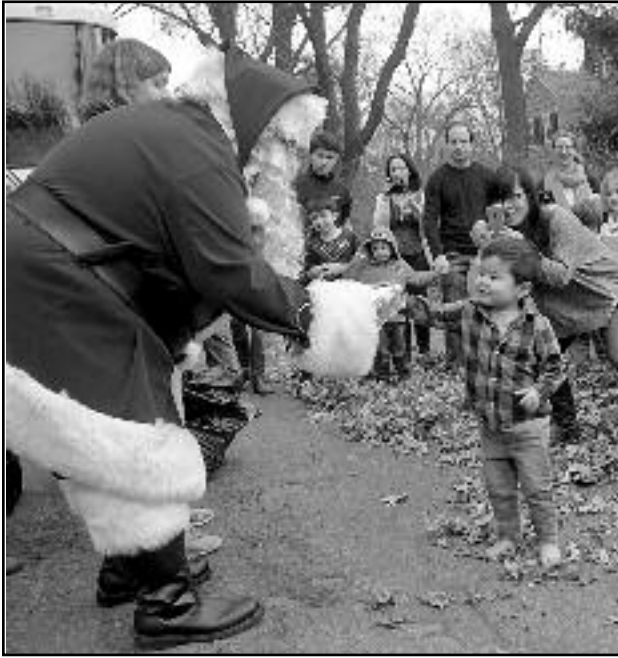
(above) A youngster comes forward to get his gift from Santa as others wait during the Fanwood Fire Dept.'s "Santa run".

The warmer-than-normal temperatures turned the watch for Santa into a series of impromptu neighborhood parties, complete with tables full of food and lots of beverages, too.