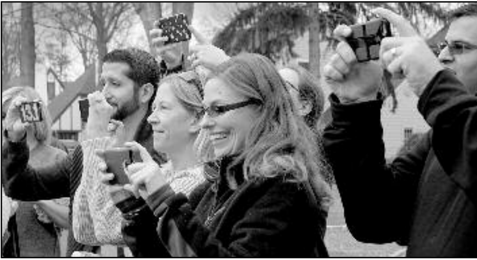
(above) Parents line up to shoot pictures of their kids with Santa during the Fanwood Fire Department's "Santa run".