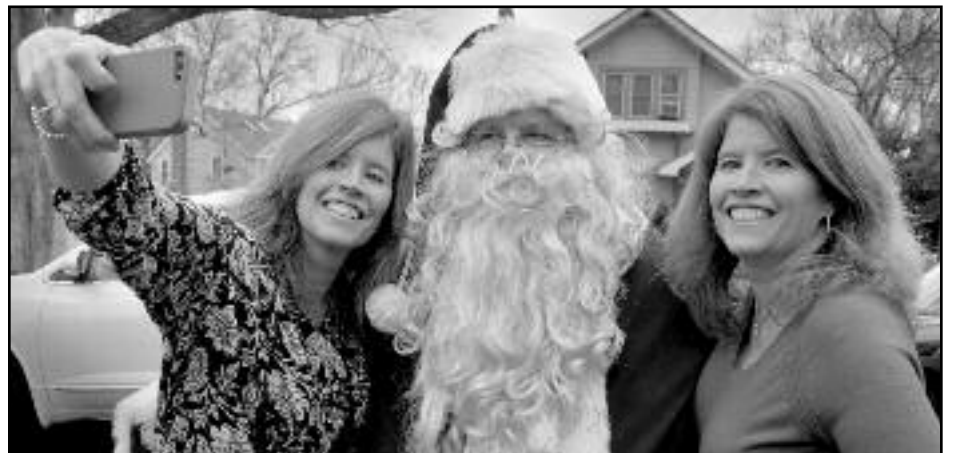
(above) It's not just the kids who want a memento during the Fanwood Fire Department's "Santa run"