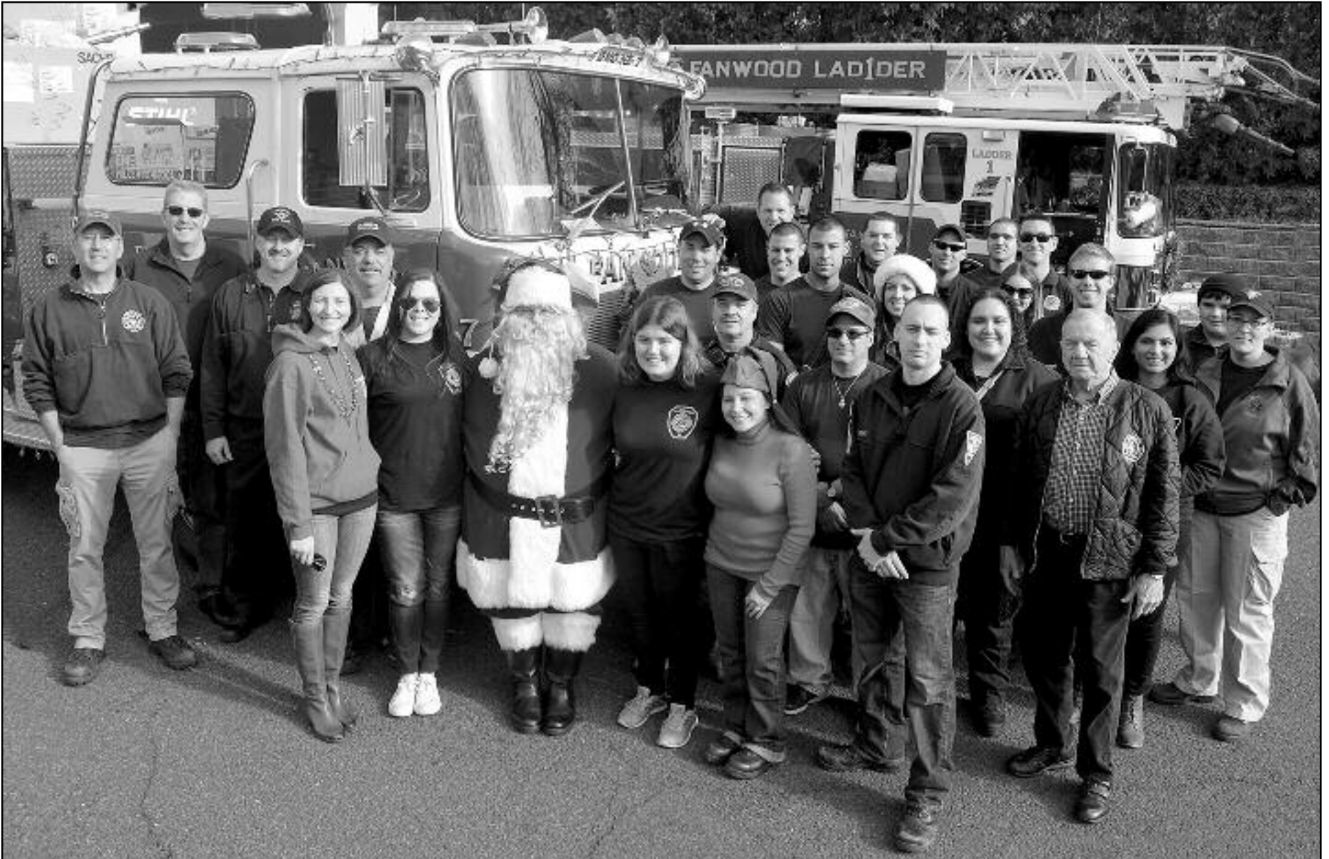
(above) Volunteers from the Fanwood Fire Department and Fanwood Rescue Squad with Santa before starting out on the annual "Santa run".