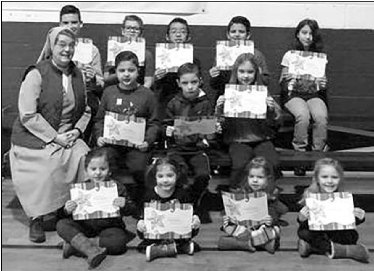
(above) All Students of the Month proudly hold up their certificates.