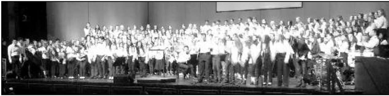
(above) Hundreds of choral music students filled the stage of an equally filled Performing Arts Center (PAC) two nights later, on Friday, Dec. 18, for the annual Winter Vocal Concert. This Combined Chorus included members of the Chorus and Advanced Chorus. They performed the final three songs of the concert, ending with "We Are The World for Haiti," by Michael Jackson and Lionel Ritchie.