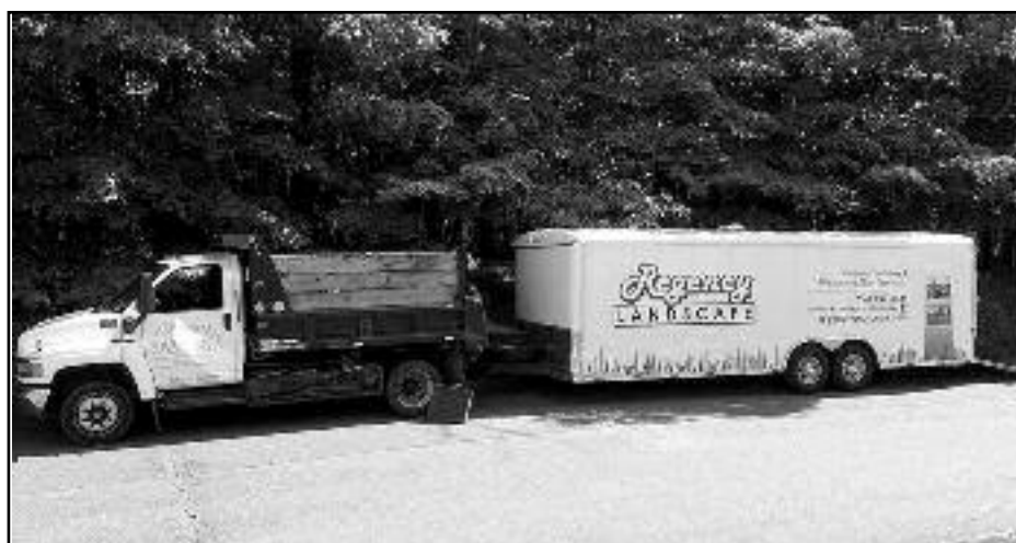
(above) Regency Landscape's trucks are a familiar site around town over the past 30 years.

PRSR STD U.S. POSTAGE PAID PHILA PA 191 PERMIT NO. 7575