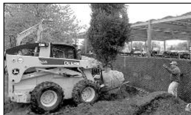
(above) Regency Landscape installing a mature Norway Spruce tree.