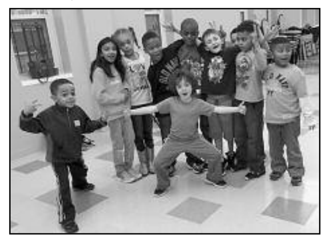
(above) Posing for a "Healthy Kids" photo.

For a better you. For a better community. For a better country. The Y.TM For a Better us.TM