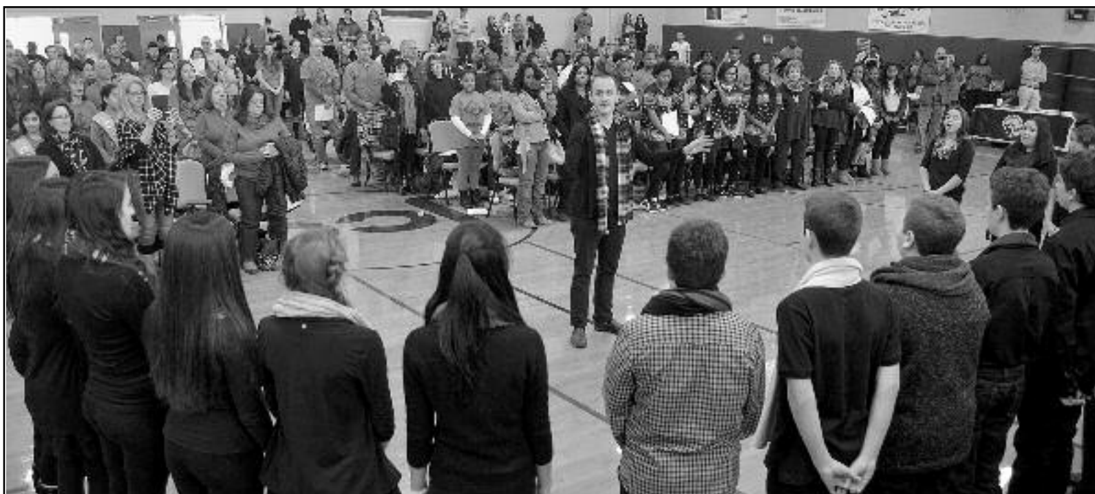
(above) A full house in the gymnasium of the Jewish Community Center listens to the Terrill Middle School choir who sang in honor of Martin Luther King.

*****ECRWSEDDM***** POSTAL PATRON FANWOOD, NJ 07023