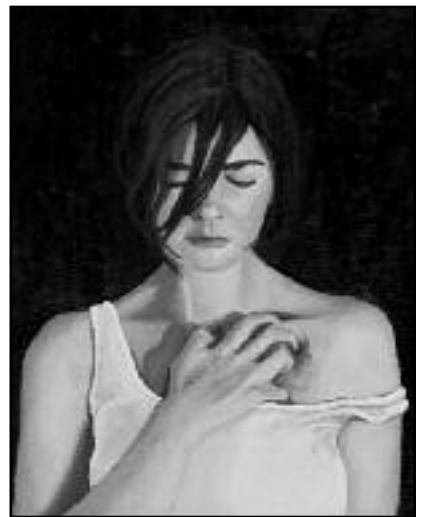
(above) titled "Skin."