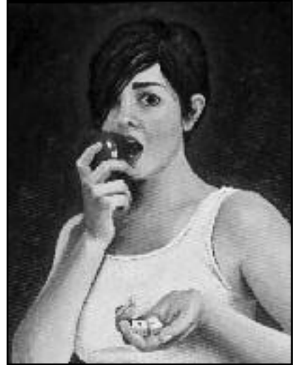
(above) Titled "Eden."