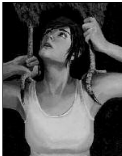
(above) Titled "Vulture Feet."