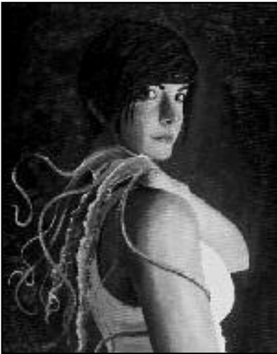
(above) Titled "Jellyfish."