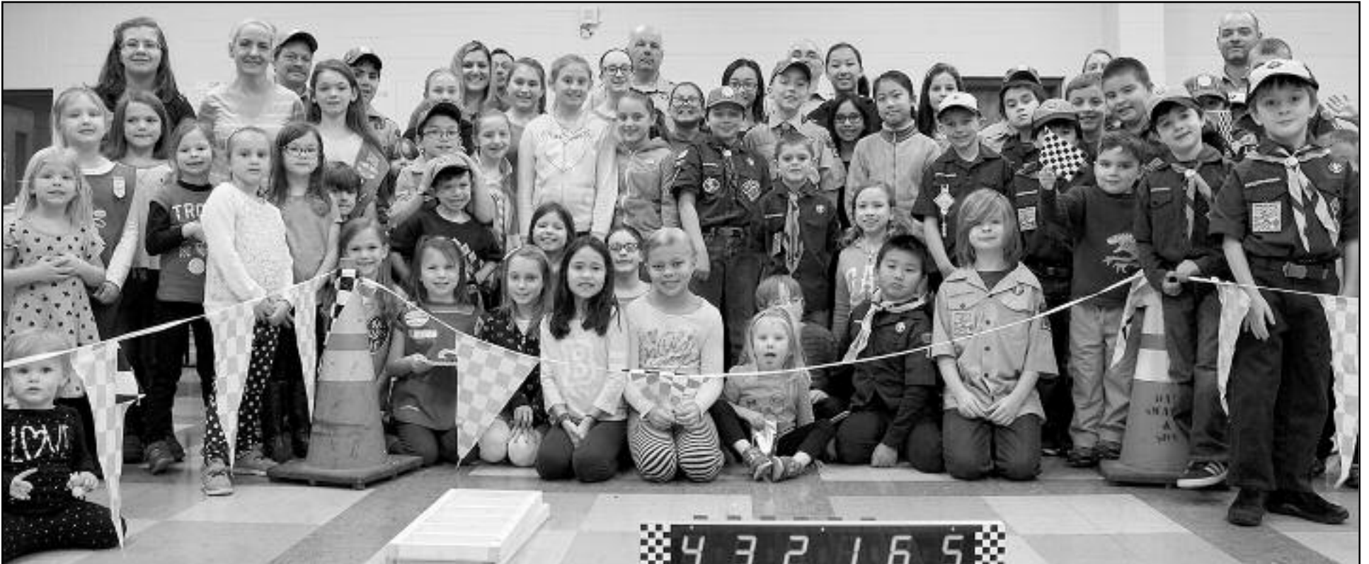
(above) Cub Scouts Pack 129 invited Girl Scouts troops from Green Brook and Dunellen to participate in the 2016 Pinewood Derby.

Cub Scouts Pack 129, based in Green Brook, is open to all boys aged 7-10 (grades 1-5). For information about Pack 129 you may visit pack129greenbrook.scoutlander.com or contact Brent Cheshire at (908) 222-3320.