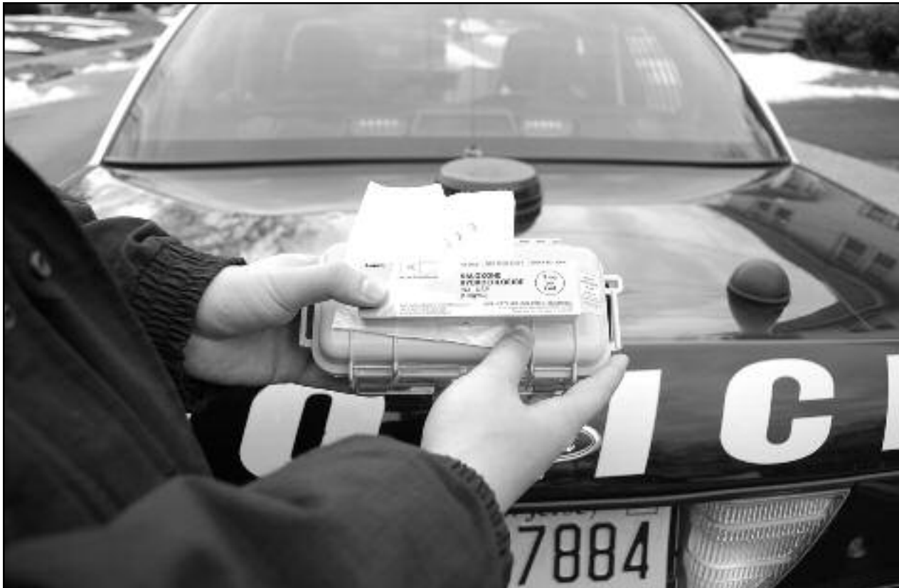
(above) Kenilworth Police officer exhibiting the Narcan dose kits carried by patrol officers.

The Kenilworth Police Department will continue to work in cooperation with the Union County Prosecutor's Office in order to provide this added service to our community.