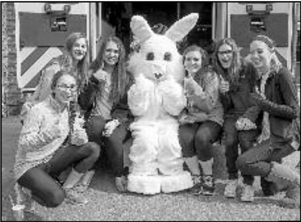
(above) Rescue Rabbit gets a thumbs up.

a prized chocolate bunny. The Mountainside Rescue Squad has been holding the Easter Egg Hunt for over two decades. They are always in need of members, if you are interested in joining or have any questions please contact them at 908-233-6338 or visit their new website www.ems22.com