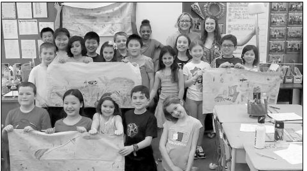
(above) Students holding up their decorated fins as part of lesson.