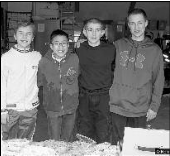
(above) Mountainside Boy Scouts volunteered their services.