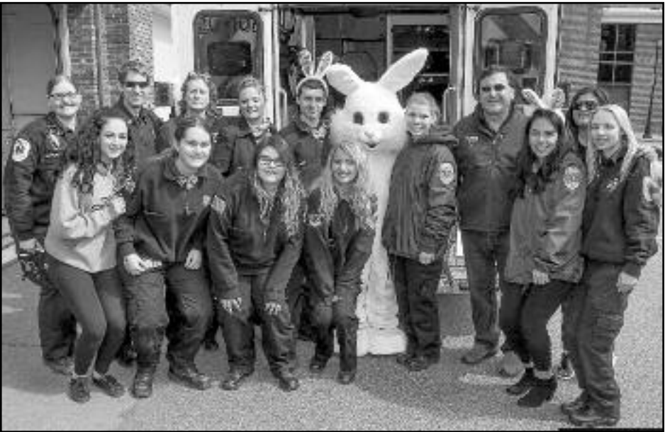
(above) Who doesn't love a picture with Rescue Rabbit?

PRSR STD U.S. POSTAGE PAID PHILA PA 191 PERMIT NO.7575