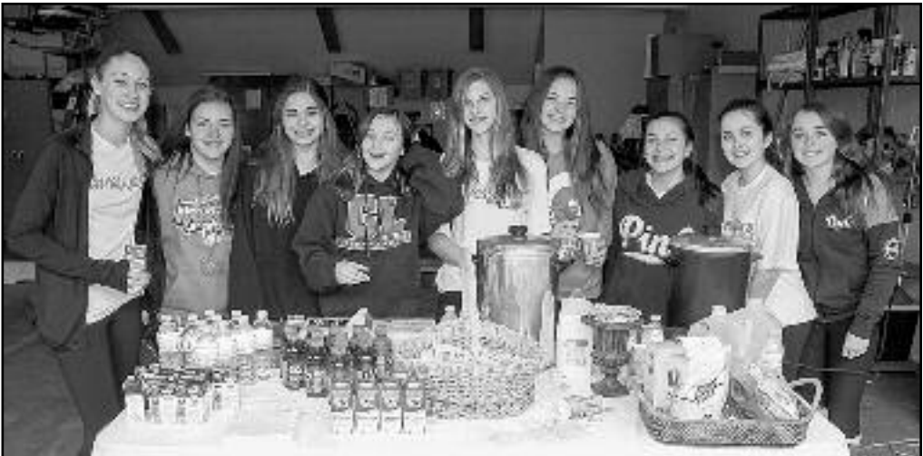
(above) Mountainside Girl Scouts sell baked goods to raise money for the American Cancer Society.

Photos of this and other events can be found at rennamedia.com and on the Mountainside View Facebook page. Feel free to “Like”, “Tag”, and “Share”.