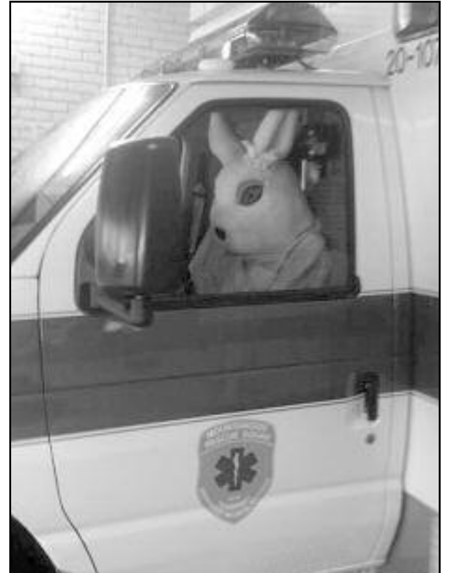
(above) Rescue Rabbit.