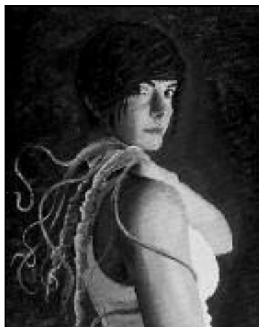
(above) Titled "Jellyfish."