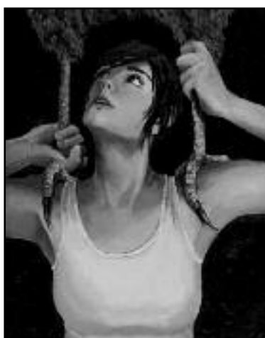
(above) Titled "Vulture Feet."