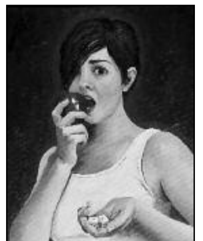
(above) Titled "Eden."