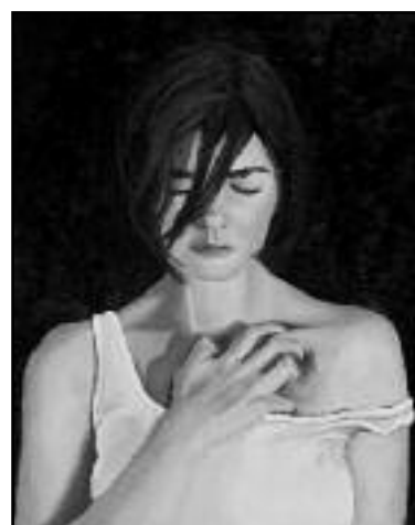
(above) Titled "Skin."