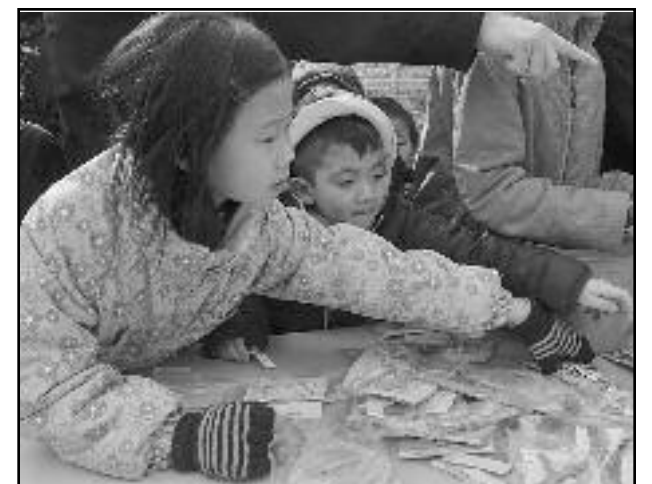
(above) Kids reach for the prizes at the annual Easter Egg Hunt.