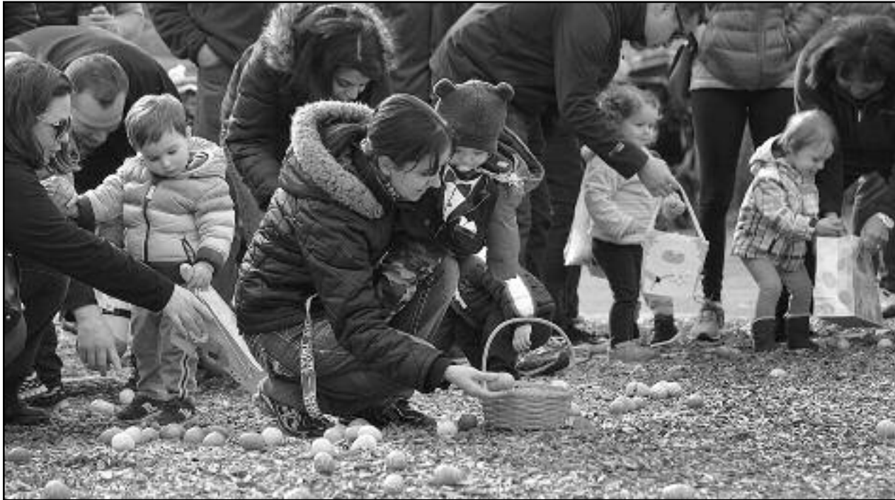
(above) With some help from the adults, the under-2 group of youngsters go for the prize eggs.