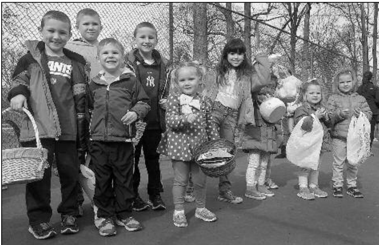
(above) A group of happy youngsters pose for a photo.