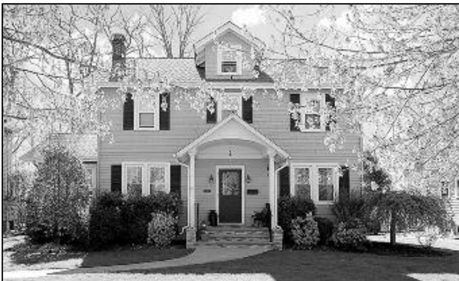
847 Dorian Road, Westfield Offered at $489,000