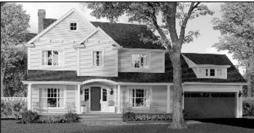
627 4th Avenue, Westfield Offered at $1,359,000