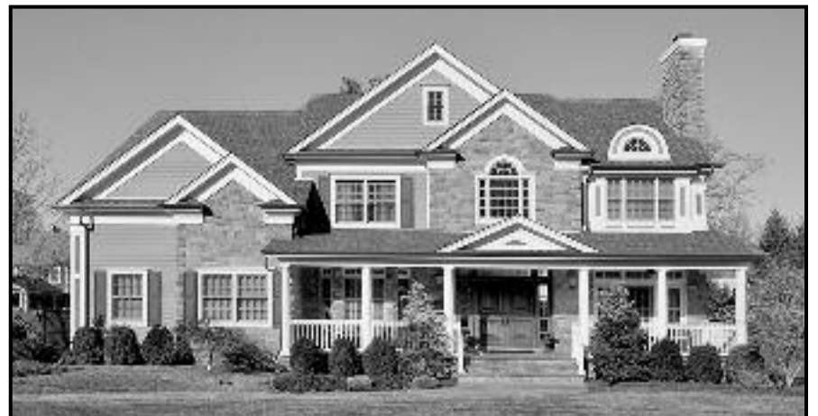
403 Quantuck Lane, Westfield Offered at $1,719,000