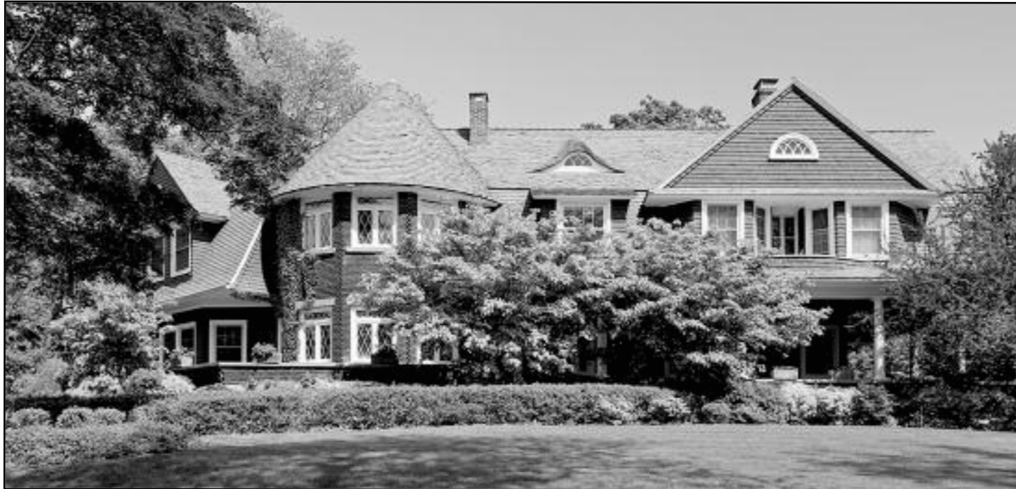
31 Stoneleigh Park, Westfield Offered at $1,950,000

Search for homes from your cell phone! Text "jbcb" to "87778"