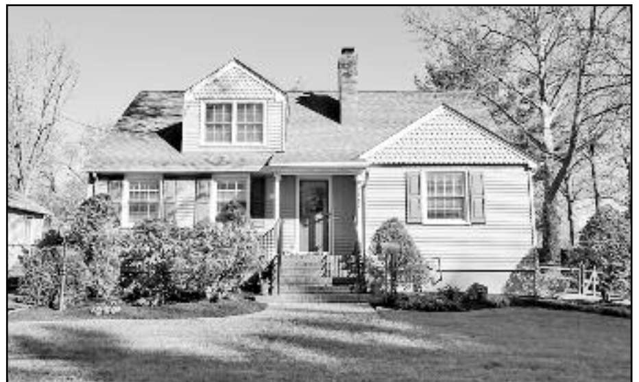
2142 Raritan Road, Scotch Plains Offered at $599,900