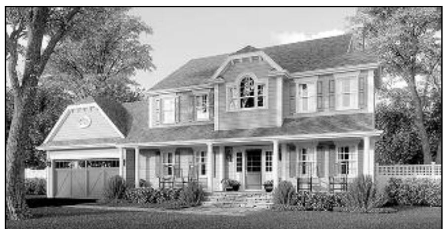
151 Wild Hedge Lane Offered at $1,399,000

COLDWELL BANKER RESIDENTIAL BROKERAGE Westfield East Office • 209 Central Avenue • 908-233-5555