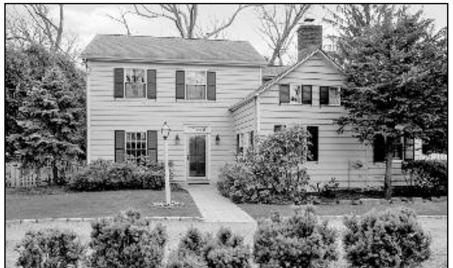
415 Woodland Avenue, Westfield Offered at $769,000