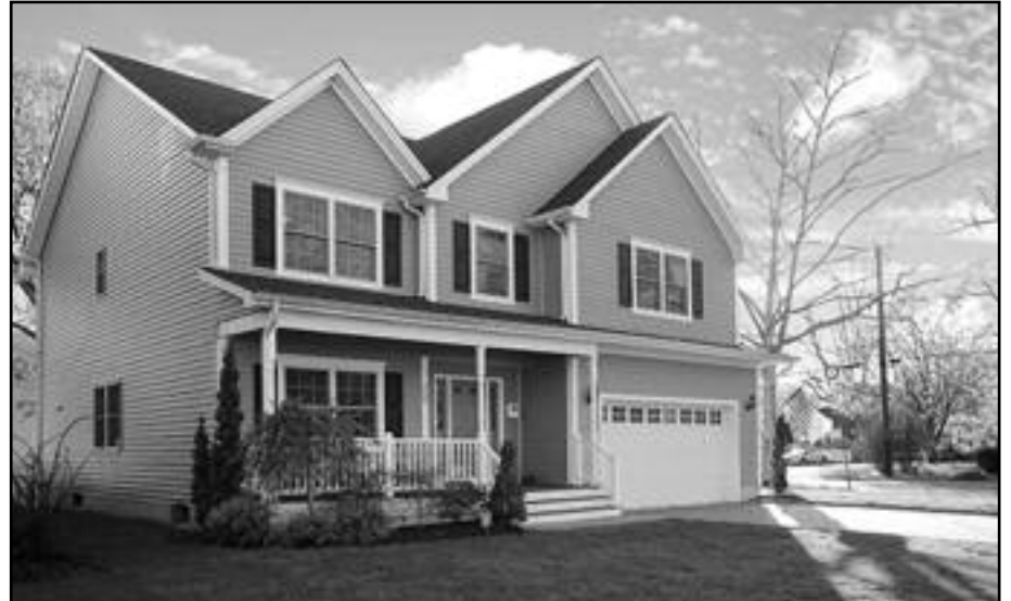
304 Cook Avenue, Scotch Plains Offered at $750,000