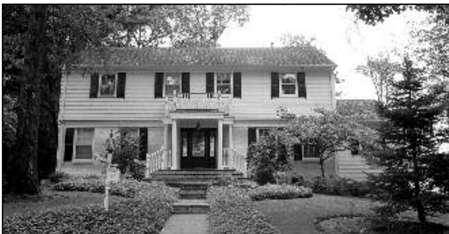
17 Mountainview Drive, Mountainside Offered at $899,000