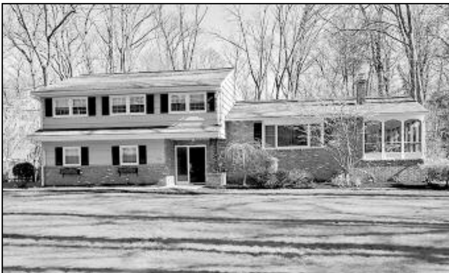
1251 Sunnyfield Lane, Scotch Plains Offered at $715,000