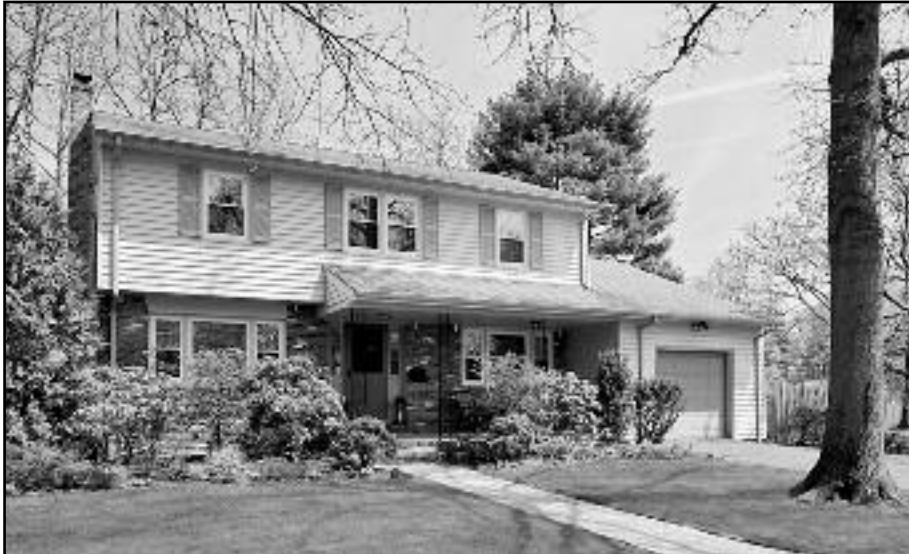
912 Brown Avenue, Westfield Offered at $674,900