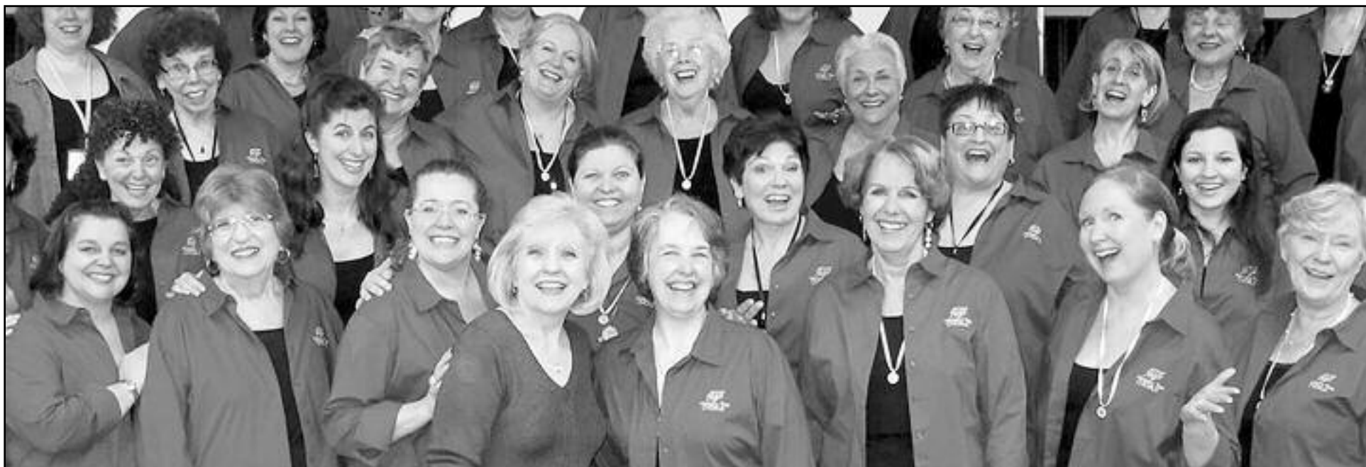
(above) Hickory Tree is an award-winning women's chorus dedicated to advancing the musical art form of four-part acappella harmony sung in the barbershop style. We are dynamic, diverse women, passionate about music, performance, fun & friendship. We invite women singers of all ages to visit us and share our passion for musical excellence. www.hickorytreechorus.org .

Joseph located at 1050 Long Hill Road, Long Hill Twp., NJ. More information can be found at hickorytreechorus.org .