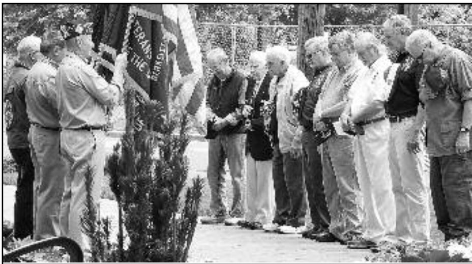
(above) During the ceremony the names were read of Berkeley Heights residents who passed away during WWII and members of the VFW Post 6259 who died during past last year.

The Ceremony ended with members of the Hickory Tree Chorus Sweet Adelines International singing ‘This is my Country’ and ‘God Bless America’.