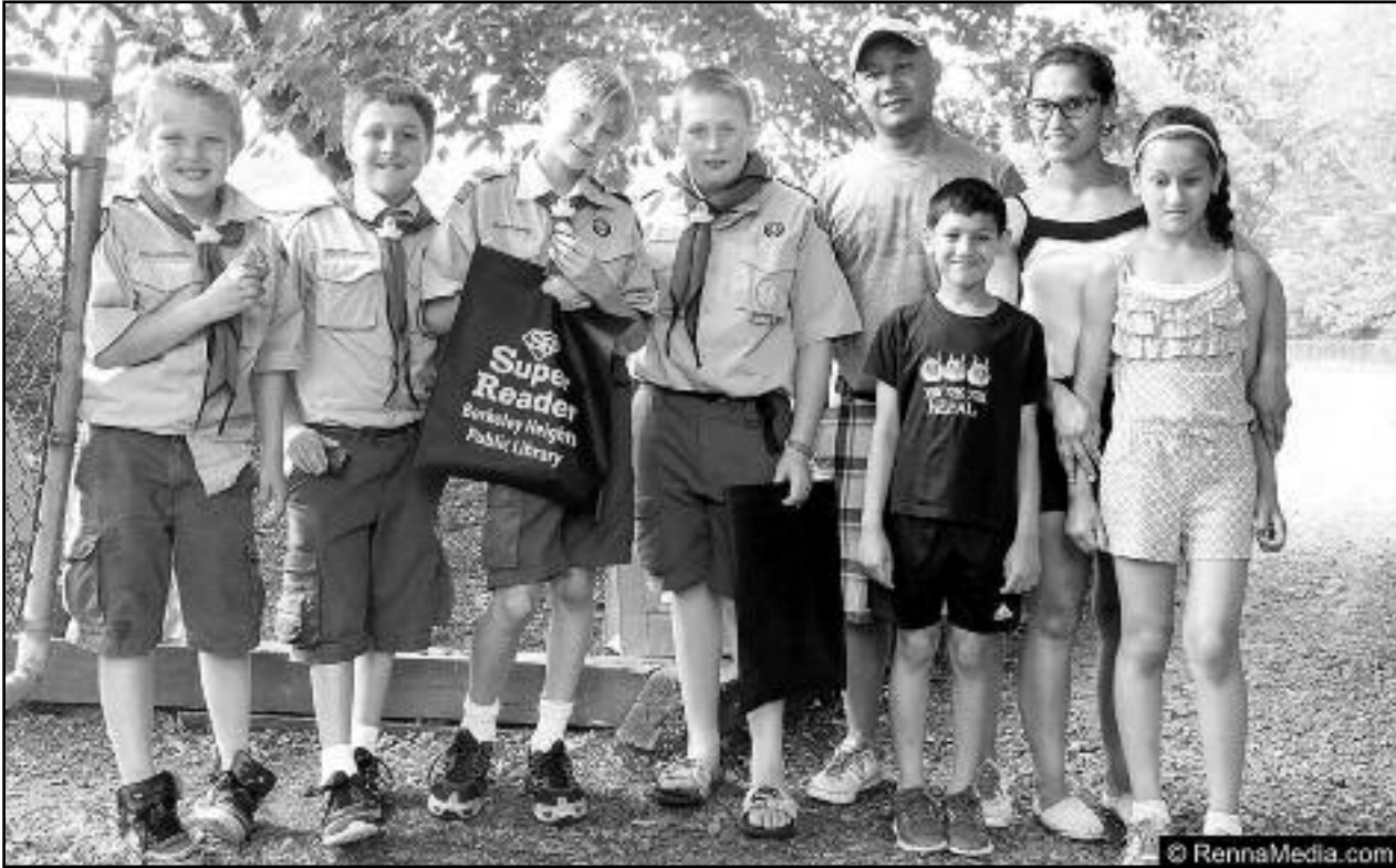
(above) Photos from this and other events can be found online at rennamedia.com and on the Berkeley Heights Community News page on facebook.com Feel free to "Like", "Tag" and "Share".

Top prize for the fastest duck this year was a Weber Spirit gas grill. Other top prizes included gift cards to Delicious Heights Restaurant, Trap Rock Restaurant, and the Chimney Rock Inn.