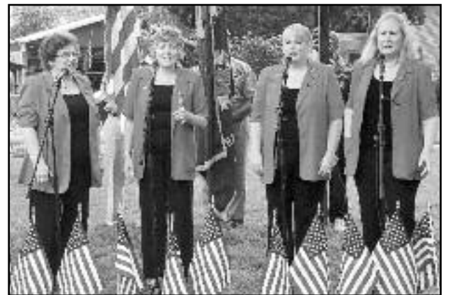
(above) Members of the Hickory Tree Chorus Sweet Adelines International sang ‘This is my Country’ and ‘God Bless America’.

Berkeley heights residents who passed away during WWII and members of the VFW Post 6259 who died during the last year. The ceremonial Wreath placement then commenced, led by post 6259.