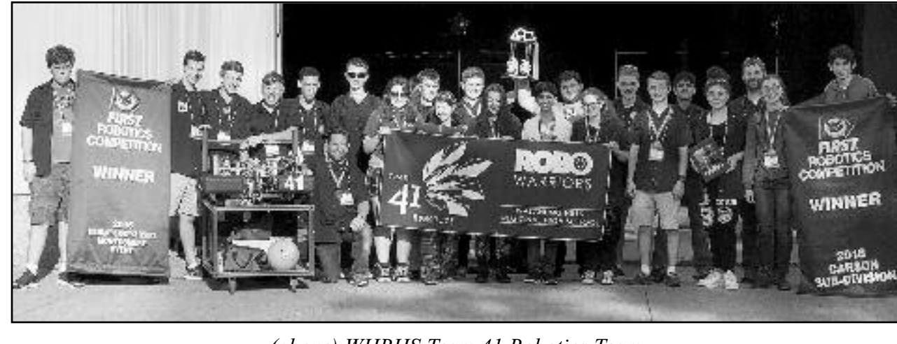
(above) WHRHS Team 41 Robotics Team

This year's Team 41 robot as seen from above, with a boulder on board, which could be flung by catapult at a tower window target to score points. The robot needed to contain its computer brain for remote control, propulsion mechanisms, and other mechanisms, such as the hydraulic piston that gives the catapult power. The bot had to be relatively quick, nimble, durable, with its vital components protected and easily repaired if the rough and tumble of competition caused damages.