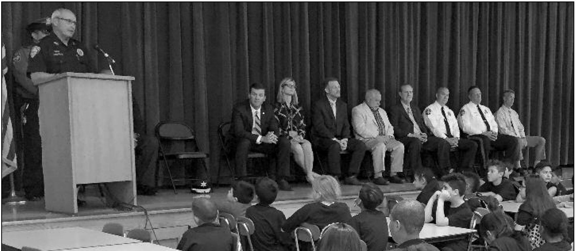
(above) Drug Abuse Resistance Education (D.A.R.E.) is an international substance abuse prevention education program that seeks to prevent use of controlled drugs, membership in gangs, and violent behavior.

The students' parents, faculty along with the rest of the community united to congratulate the students on their accomplishments and pledges to be the best they can be. The D.A.R.E Program will continue next year, to teach more students on how to be responsible and say no to gangs, drugs and alcohol.