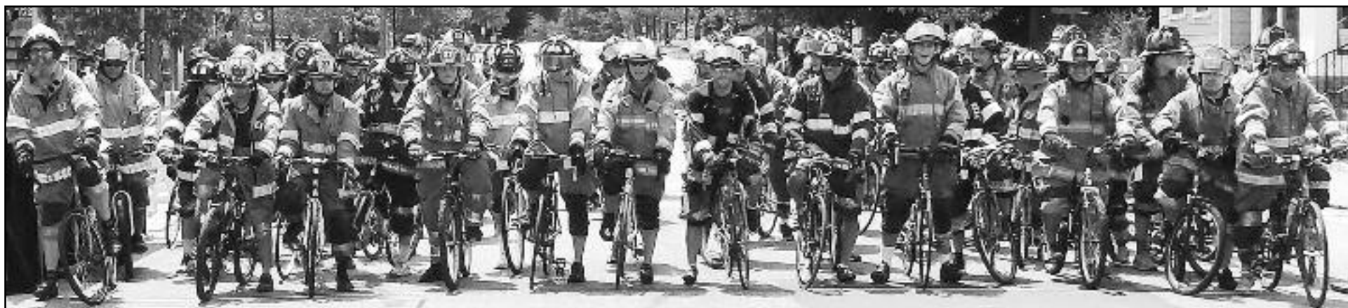
(above) Firefighters line up at starting position.

For photos of the race go to Stirling's website: www.stirlingfd.com and click on the Facebook icon. The 2017 race will be held on Sunday, September 26, 2017. Please plan to attend and participate as a firefighter racer if possible. Information will be on this website next spring.