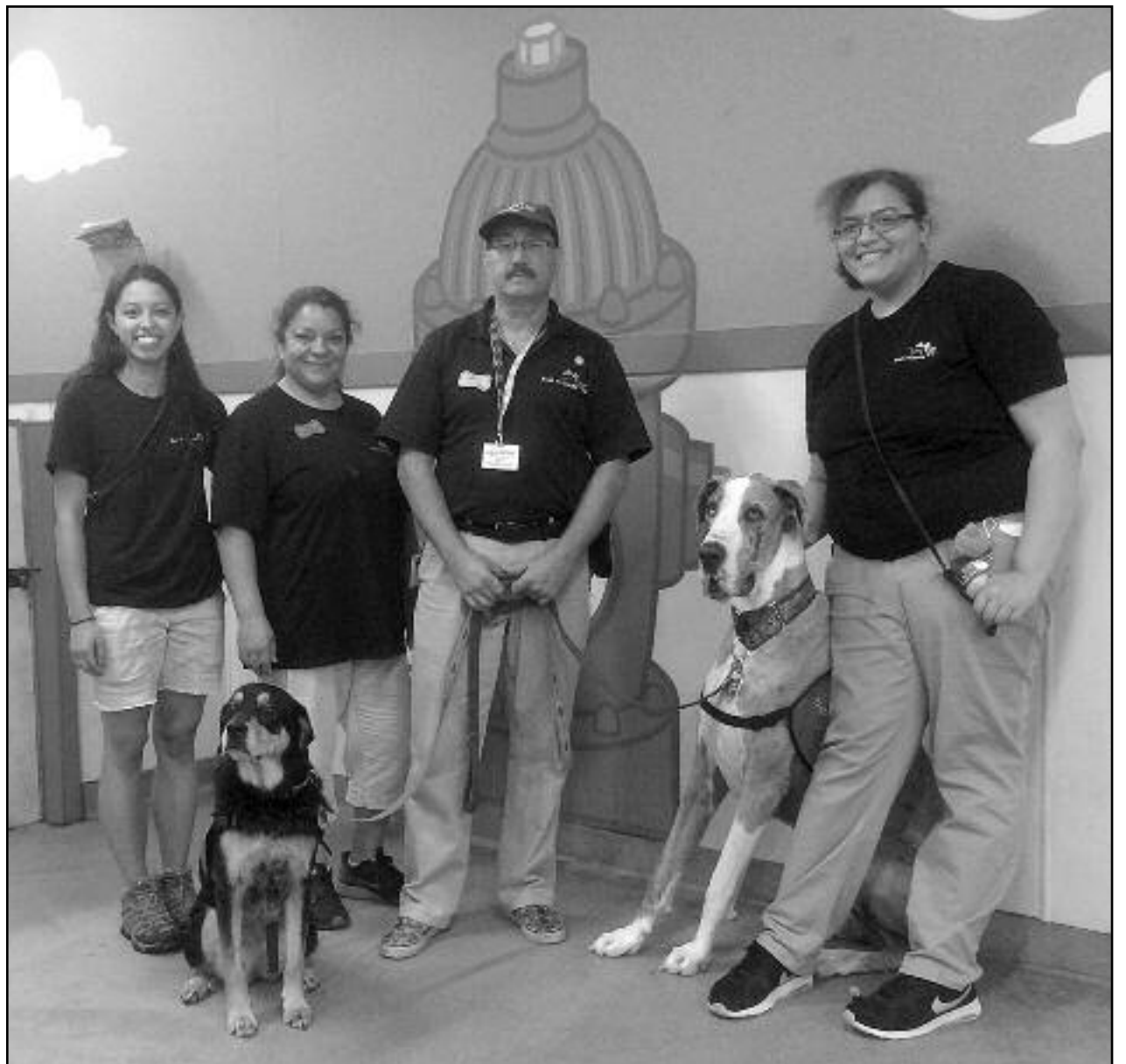
(above) The Staff of Best Friends Pet Care and some friends.