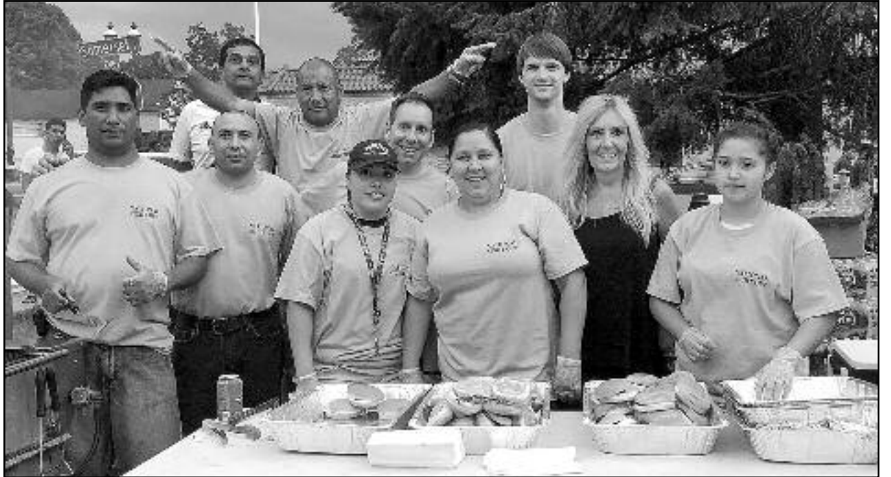
(above) Members of the community working as a team to make and serve food for the visitors of the event.

Families from all over town came together to share food and music provided by volunteers from local businesses. The night ended successfully when members of the community learned more about drug and alcohol abuse and how to keep children off the streets which was all made possible by the men and women who help serve and protect North Plainfield.