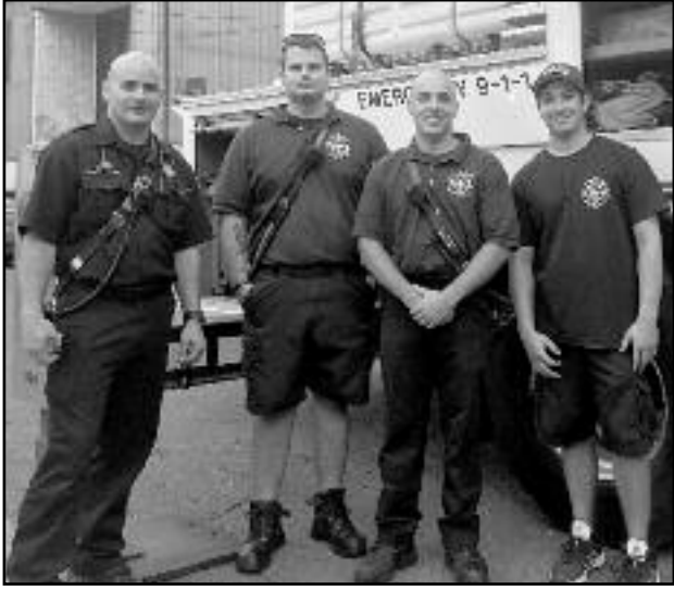
(above) EMTs and members of the fire department coming together to show their faces to help make the town feel safe and know who is protecting the community.