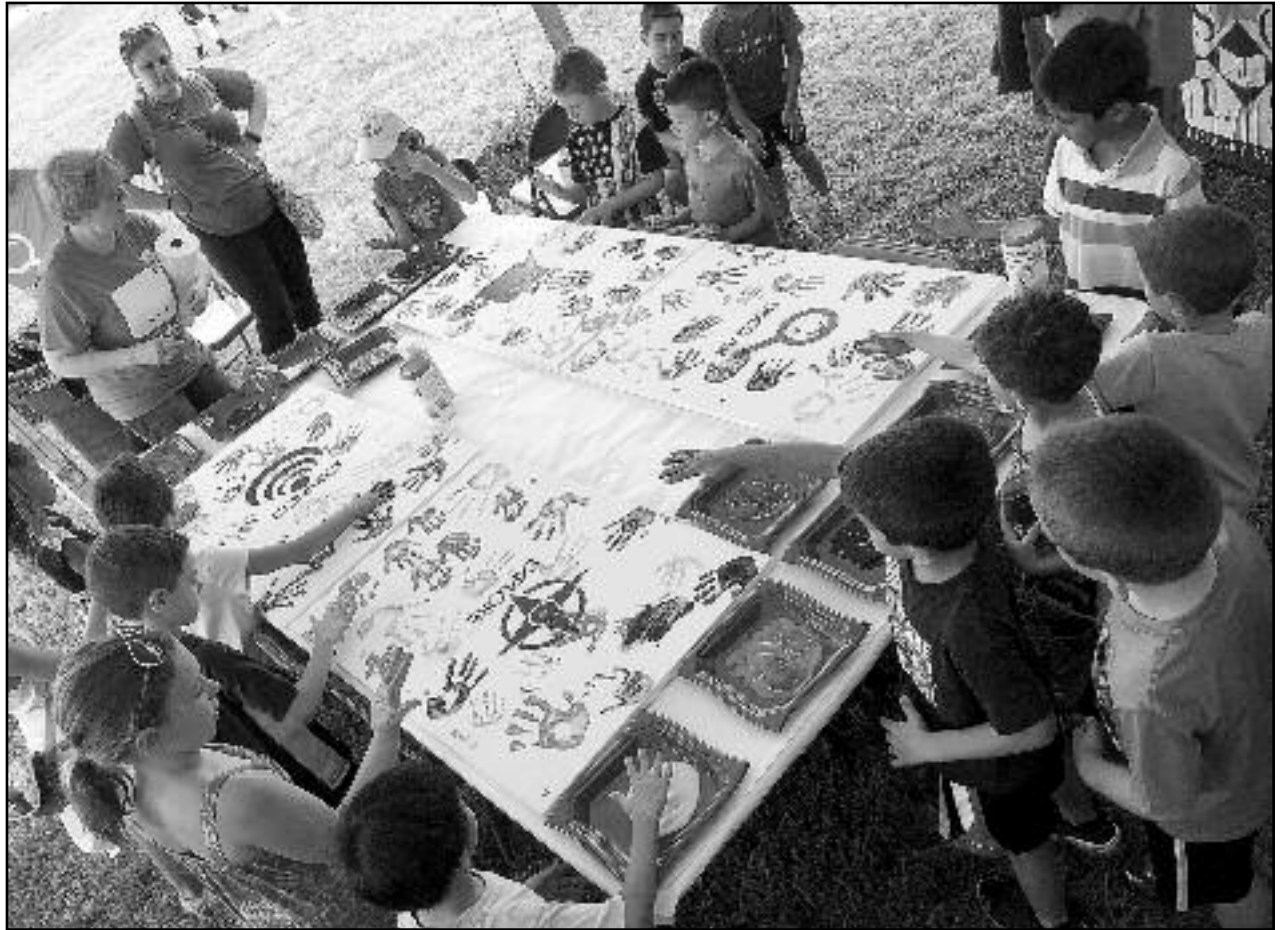
(above) Children participating in the creation of the Somerset County Community Mural.