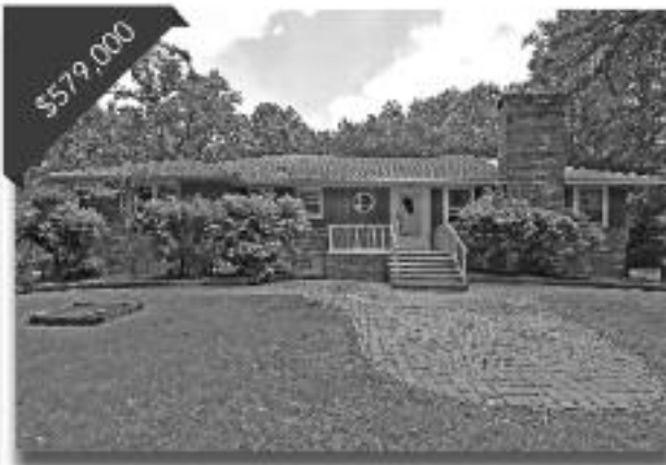
22 Old Smalleytown Road 3 Bedrooms, 2 Baths Must see Home Larger than it Appears! Located on a Large, Level Lot. 22oldsmalleytown.com