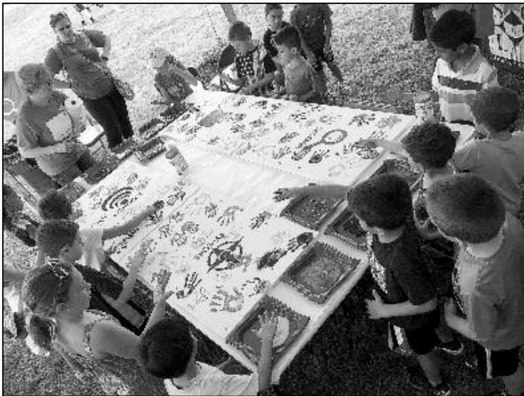
(above) Children participating in the creation of the Somerset County Community Mural which will be on tour to all of the Somerset County libraries