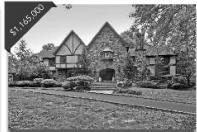
2 Providence Road 5 Bedrooms, 3.1 Baths Exquisitely Crafted Home Beautifully Landscaped and Located on Quiet Cul-de-Sac. 2Providence.com