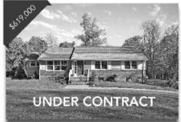
16 King George Road 3 Bedrooms, 3 Baths Raised Ranch on Over 2 Private Acres with Fabulous 4 Season Porch With Gas Stove. 16KingGeorge.com