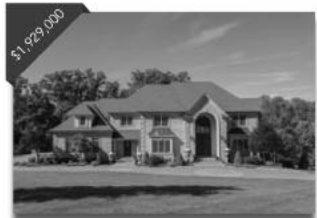
13 Quail Run 5 Bedrooms, 3.1 Baths Stunning Center Hall Colonial with Resort Like Backyard with Heated Pool and Pool House. 13Quail.com