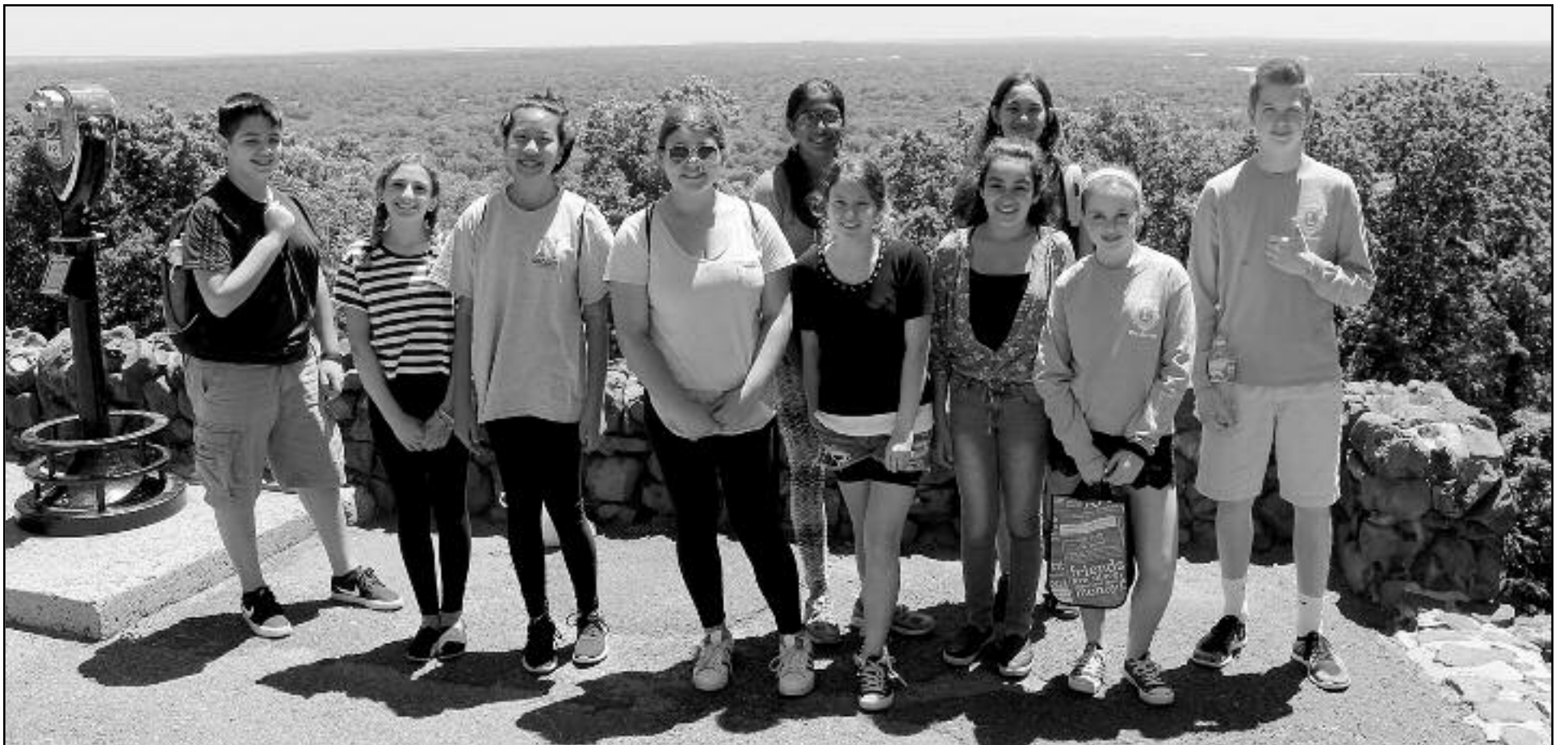
(above) Warren Middle School 8th graders enjoy the view at Washington Rock the same spot General George Washington is said to have used to monitor British troop movements more than 200 years ago.

ALT for a discussion about the comings and goings of the Continental Army during colonial times. The outing wraps up at Washington Rock where students enjoy a pizza lunch (with the help of PTO parents) and a spectacular view of the vista over which General Washington is said to have frequently cast an eye to monitor British troop movements in the valley below.