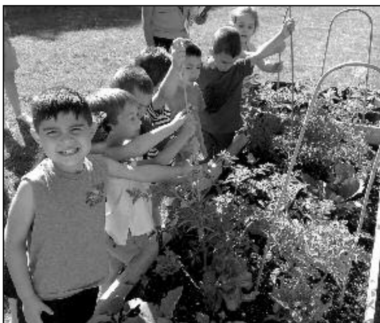
(above) Kindergartners help stake tomatoes in the new garden at Mt. Horeb School

Each summer, the Warren Township Board of Education offers children an array of enrichment opportunities through its Summer Fun program, with such creative and eclectic offerings as School of Rock, So You Wanna Sew?, Adventures in Yoga, Innovation Station and much more. Small group instruction in math and language arts is also available for students, ages pre-school through 8th grade, who are recommended for extra help.