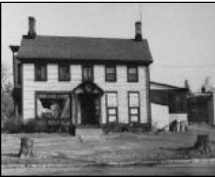
(left) The original Chrone's from 1946

PRSR STD U.S. POSTAGE PAID PHILA PA 191 PERMIT NO. 7575